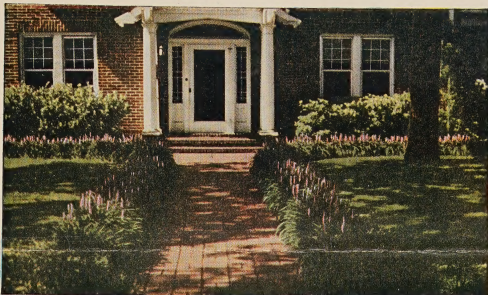
REPRODUCED FROM EASTMAN NATURAL COLOR PHOTOGRAPH

W E TAKE REAL PRIDE in introducing to our friends and customers a splendid new variety of Liriope muscari which we call Majestic. We have been testing it for several years in various parts of the country and now feel sure it is worthy of a prominent place in home gardens from coast to coast.