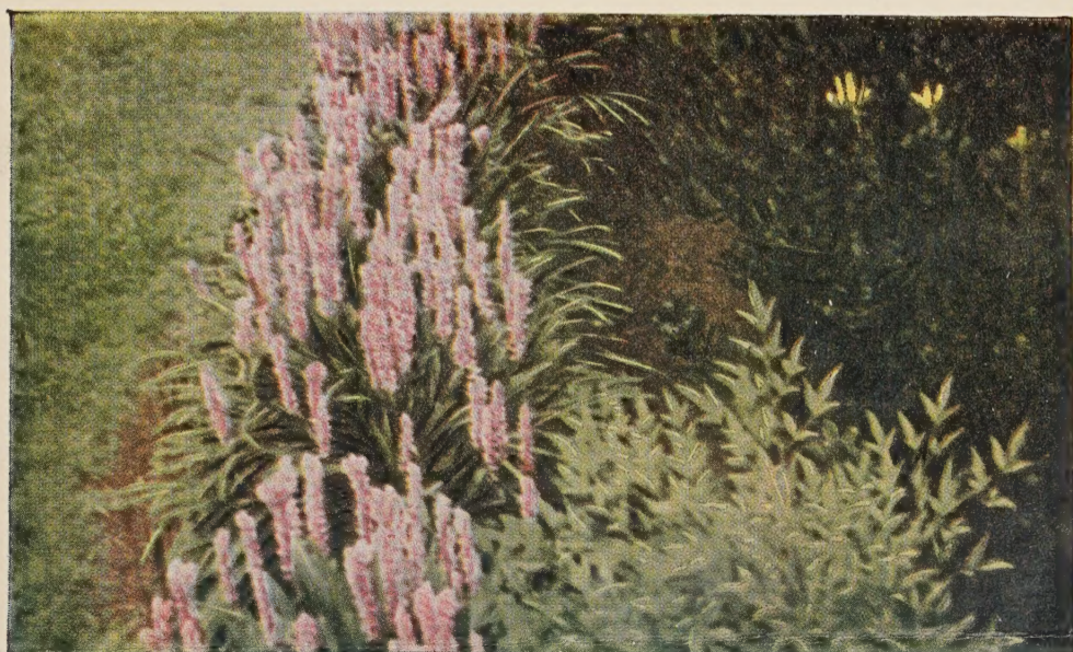
REPRODUCED FROM EASTMAN NATURAL COLOR PHOTOGRAPH