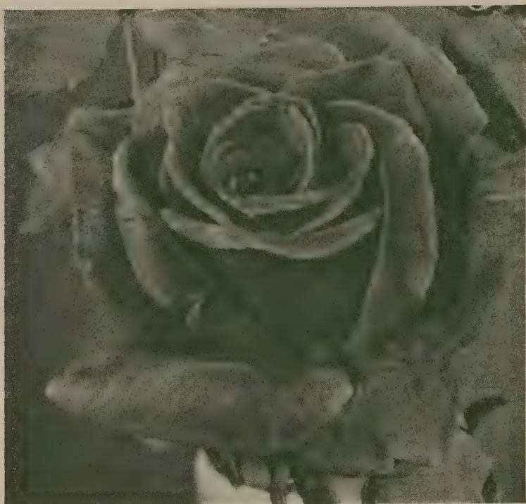
R42. NOCTURNE, $2.00.