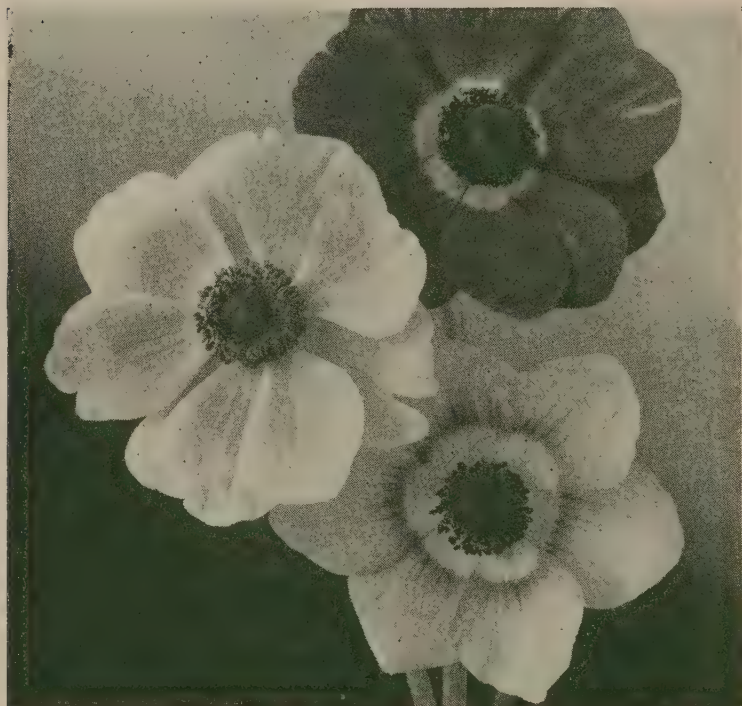
FB11. ANEMONES MONARCH DE CAEN.