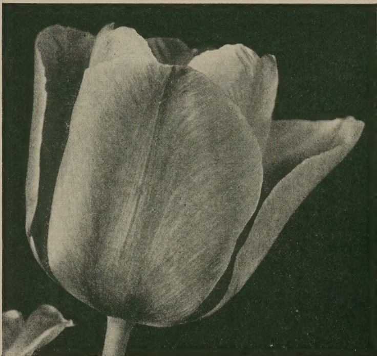
FB504. BLEU AIMABLE.

October to December is the best time to plant tulip bulbs, although they may be planted until early January. Plant tulips 6 inches deep in sandy soil and 5 inches deep in heavy soil. Place a handful of sand under each bulb and water thoroughly after planting. Do not allow soil to dry out, especially after growth appears above soil surface. Do not allow manure or chemical fertilizer to come in contact with the bulbs. Should soil be poor, dig in well-rotted cow manure several weeks before planting. For best results, plant new tulip bulbs every year.