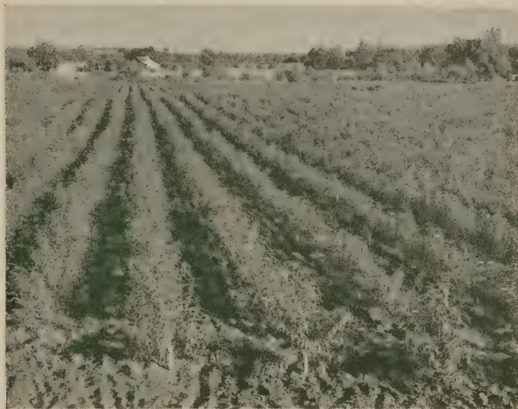
YOUNG TREES IN THE NURSERY ROWS AT OUR FOOTHILL GROWING GROUNDS, NEAR LOOMIS, PLACER COUNTY.

Fruit trees listed in this section will be ready for shipment beginning in early January. We suggest placing Fall orders so that they may be filled while stock is complete.