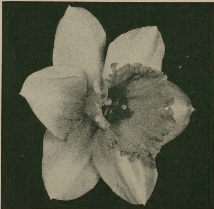
FB139. SILVER STAR.

WINTER GOLD (1). FB110. Very early; long, straight trumpet of deep golden yellow is frilled at mouth. Perianth bright yellow. Each 25c; 12 for $2.50; 100 for $22.50.