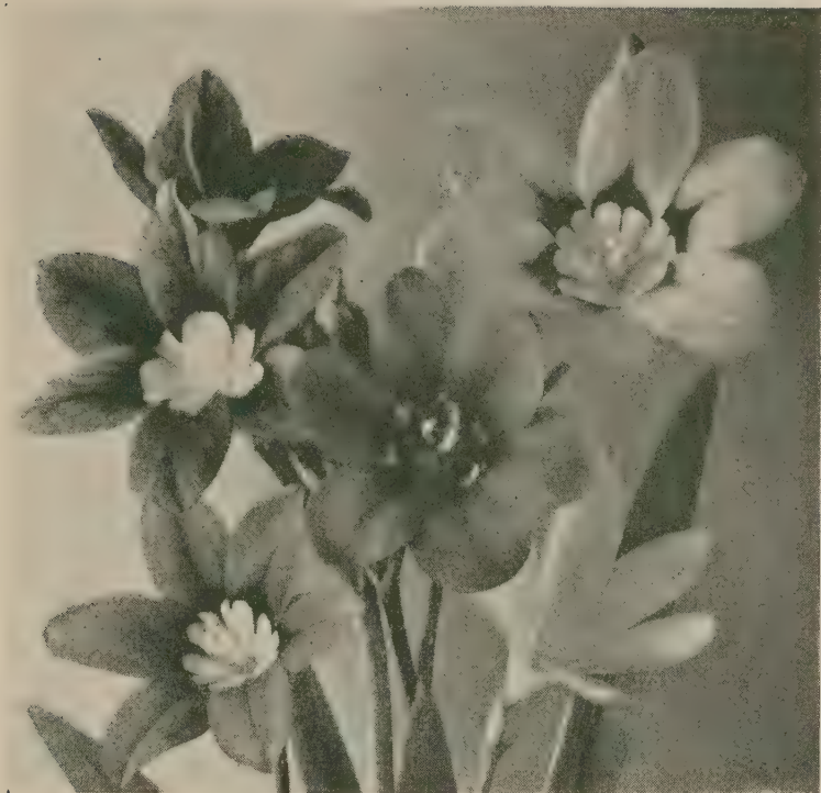
FB461. SPARAXIS HYBRIDS.