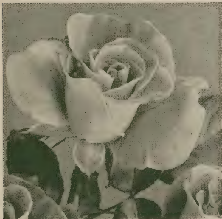
CR14. CLG. MME. HENRI GUILLOT, $2.00.