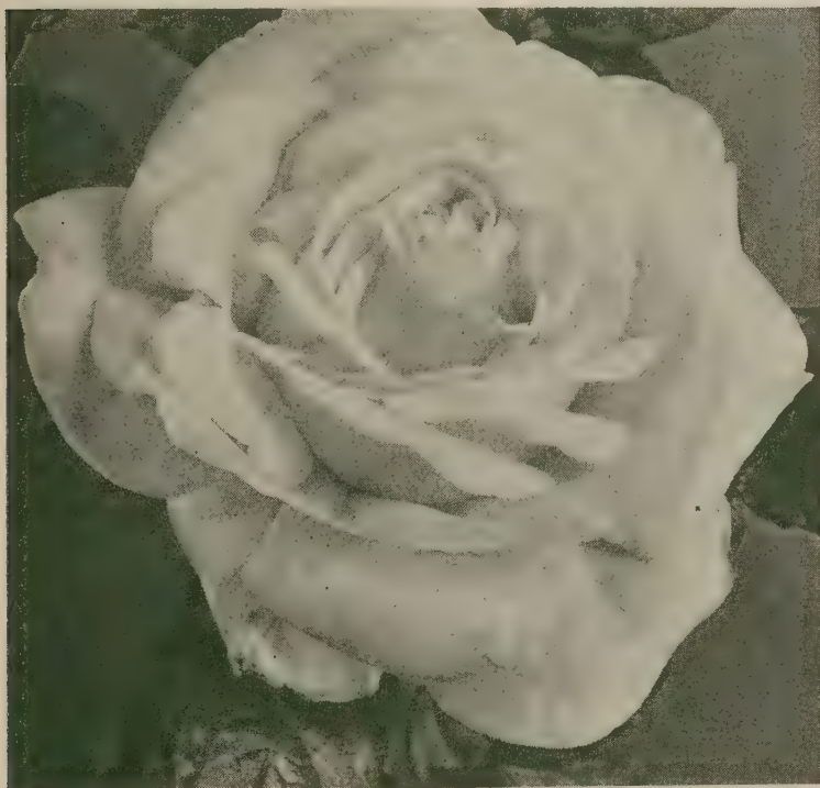
R43. PEACE, $2.00.

PEACE. R43. (Mme. A. Meilland.) (Plant Pat. No. 591.) This All-American Winner for 1946 is still receiving wide acclaim. One marvel of this rose is the range of colors through which it passes—from opening yellow buds with edges of picoteed cerise, to glorious 5-inch blooms of alabaster white. Each petal is edged with pink which seems to deepen as the bud opens around a high-pointed center of tawny yellow. The vigorous plant with clean, glossy foliage is as superior as the bloom. Recommended for all sections without reservation. $2.00 each; 3 for $5.00.