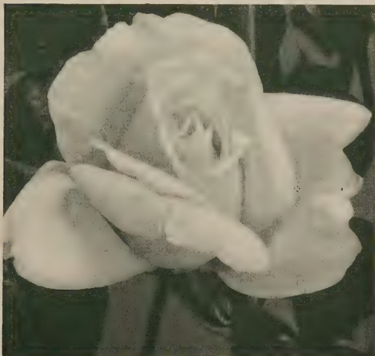
R39. MME. MARIE CURIE, $1.50.

ETOILE DE HOLLANDE. R17. Brilliant red; strong grower; fragrant. $1.00.