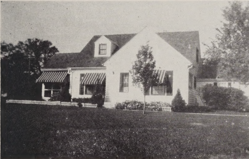
Home of Gladview Gardens.

CREAMY WHITE — WHITE GOLD in this class needs no introduction. It was really tops the past season. CORONA , another huge glad with a pink picot edge, is very popular. It is a consistent performer.