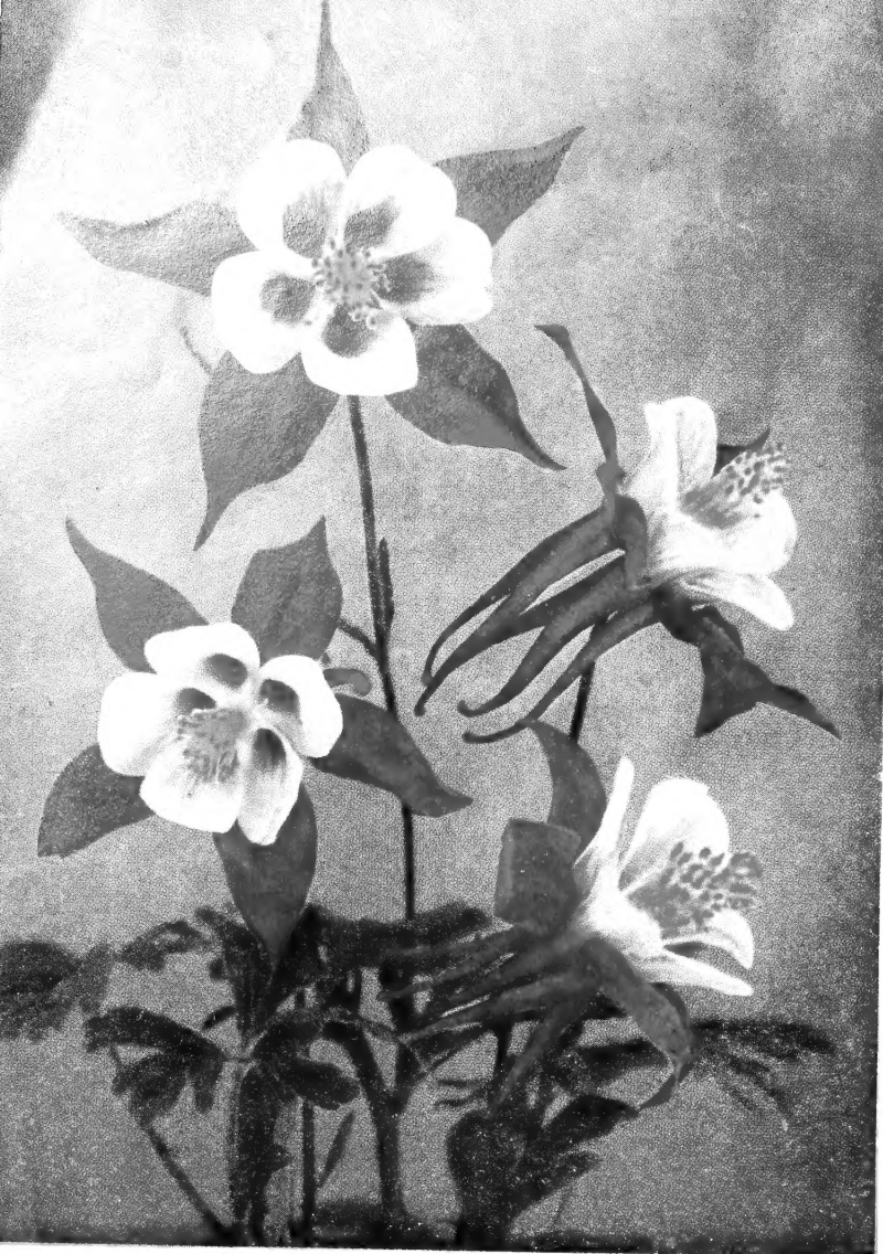
AQUILEGIA, CRIMSON STAR