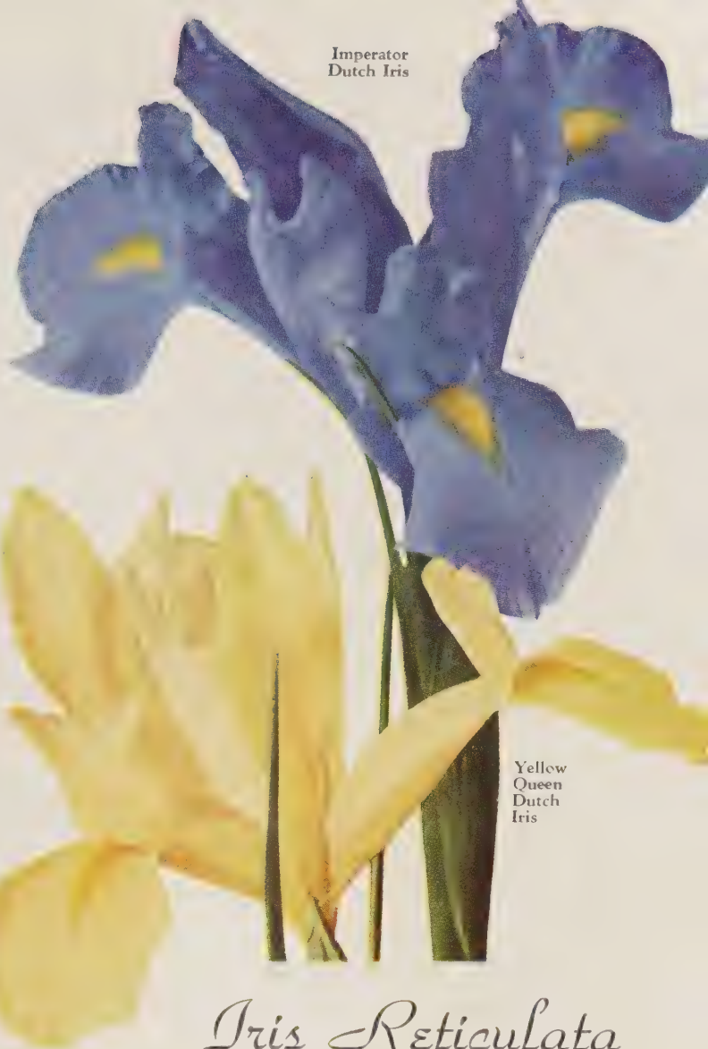
Imperator Dutch Iris

MIXED DUTCH IRIS. All colors mixed. $1.10 per doz.; $8.00 per 100.