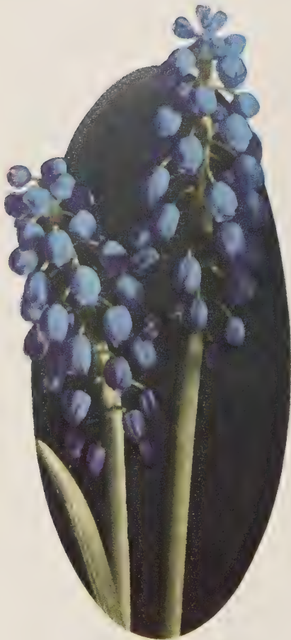
Muscari, Heavenly Blue

WHITE. New large size flowers. 85c per doz.; $6.00 per 100.