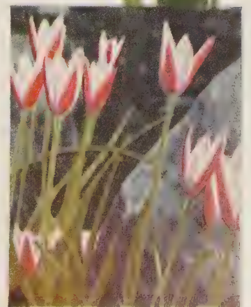
Kaufmanniana, The First

PRAESTANS, FUSILIER. 18 inches. The tallest and largest of the Praestans type. Flowers are bright vermilion-red, produced 4 to 5 per plant, at one time ..... .95 3.25