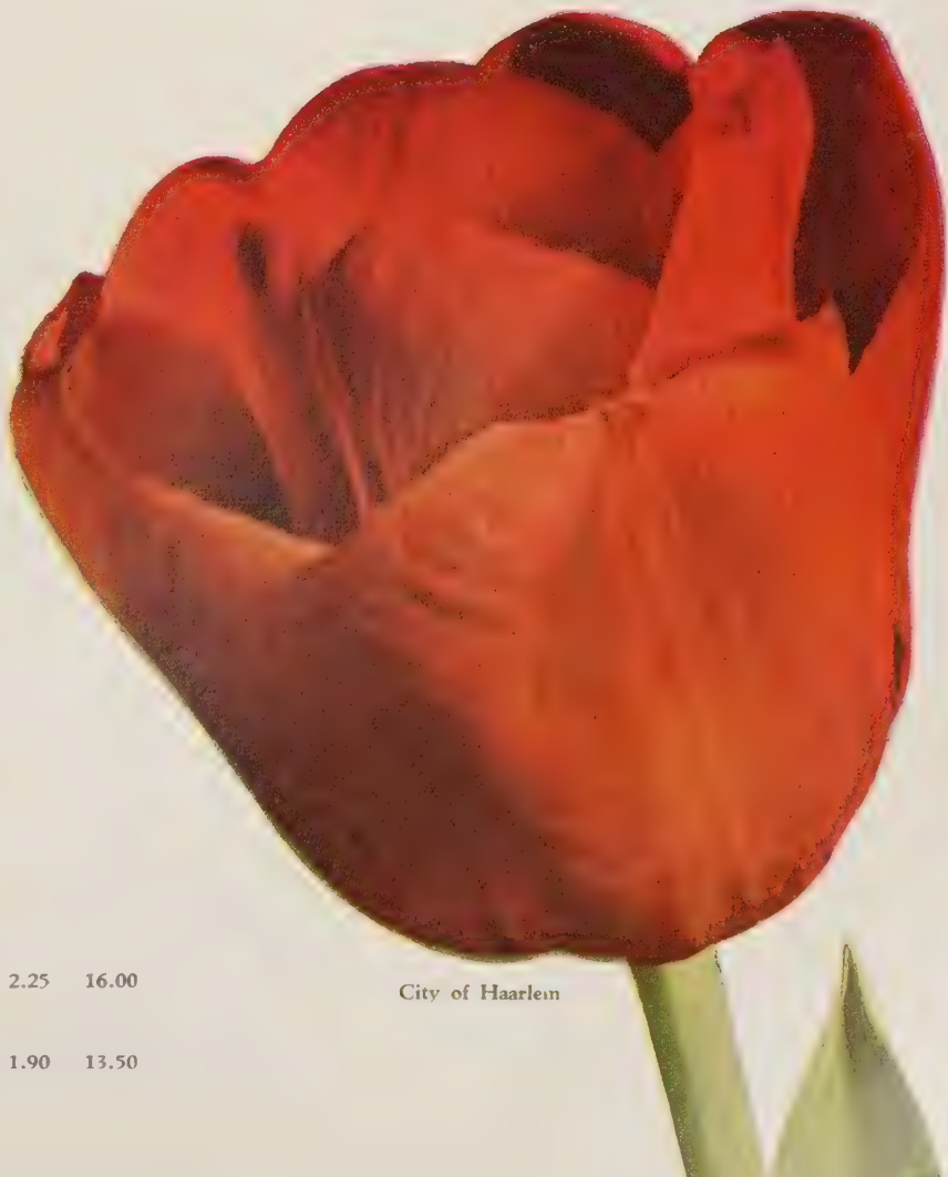
City of Haarlem