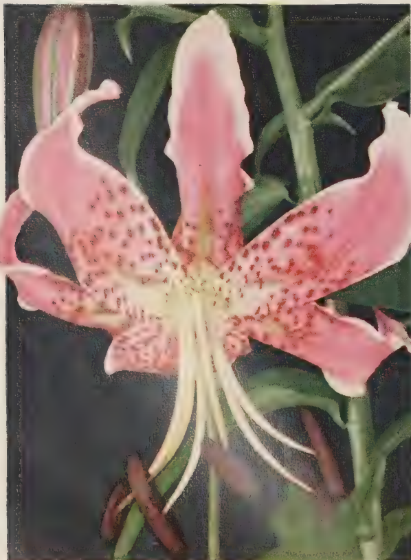
Lilium Speciosum Rubrum

These beautiful little Iris do not grow over four inches high, and bloom in April and May. They are fine for bordering flower beds, or planting in the rock garden. Many will bloom again in the fall. Order early. $2.60 per doz.