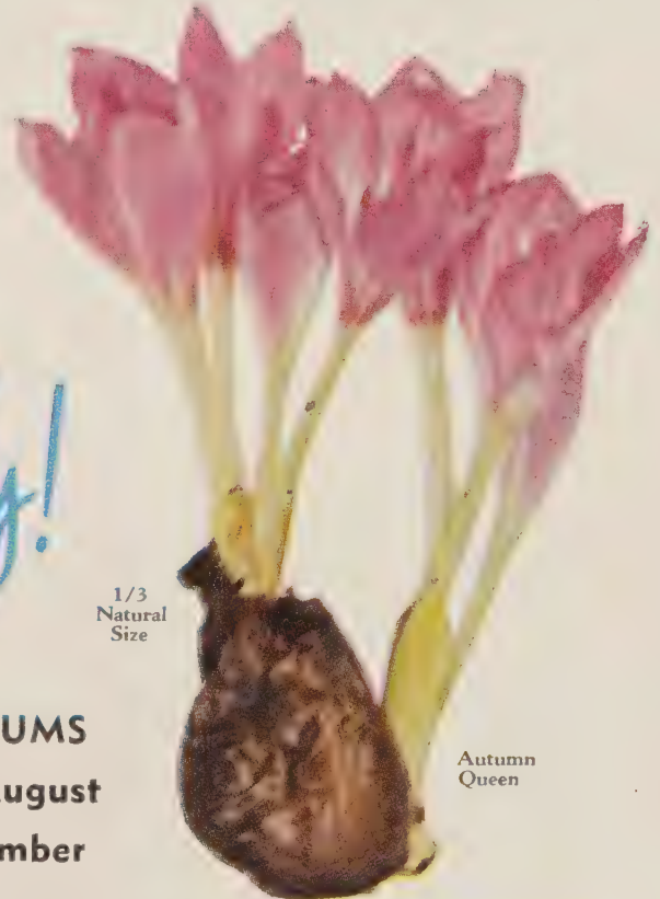
1/3 Natural Size

Colchicums for Christmas shipment. 3 for $2.25.