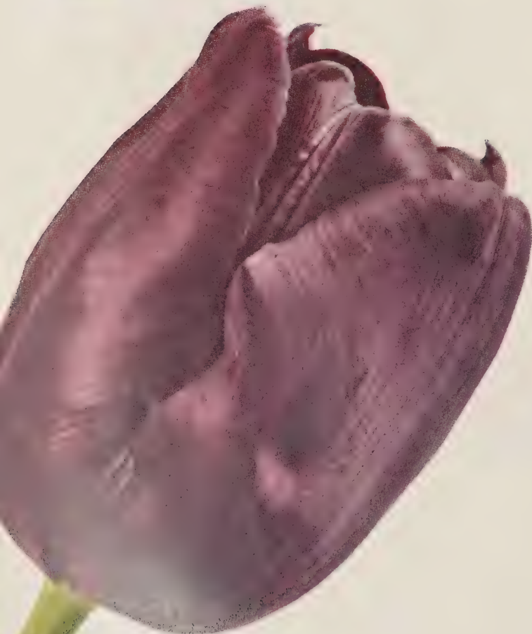
La Tulipe Noire