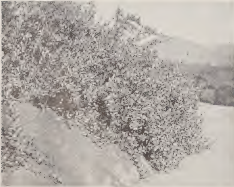
Lemonade Berry ( Rhus integrifolia ). Used here for holding bank on hillside driveway. One of the best shrubs for dry slopes. See page 19.

* Populus trichocarpa . "Black Cottonwood." One of the most beautiful of all the deciduous trees. A medium sized tree with broad head of upright branches. The bark is grayish often with a yellowish cast and deeply furrowed in age. The leaves are large, deep rich green above, whitish or silvery beneath. Of rapid growth. Makes a splendid shade tree and will thrive in any location with a fair amount of water. Gallon cans, 85c.