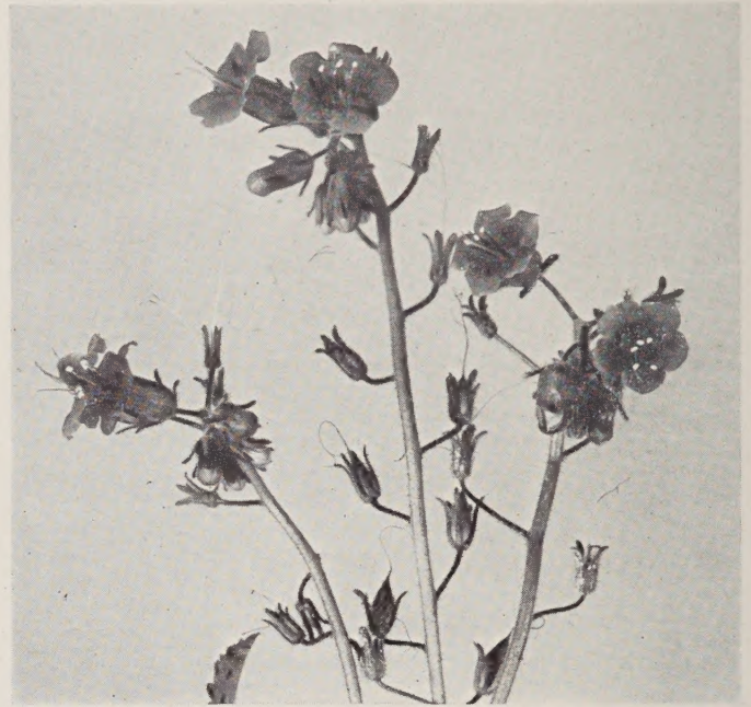
Wild Canterbury Bell ( Phacelia whitlavia ). Large bell-shaped flowers of deep violet purple.

Nemophila maculata . "Spotted Nemophila." White with a large deep purple blotch on each petal. 4 to 8 inches. Packet, 10c; ounce, 60c; ¼ pound, $1.80; pound, $6.00.