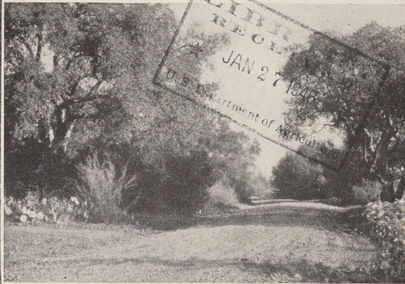
CALIFORNIA LIVE OAKS Photograph by Ralph D. Cornell.