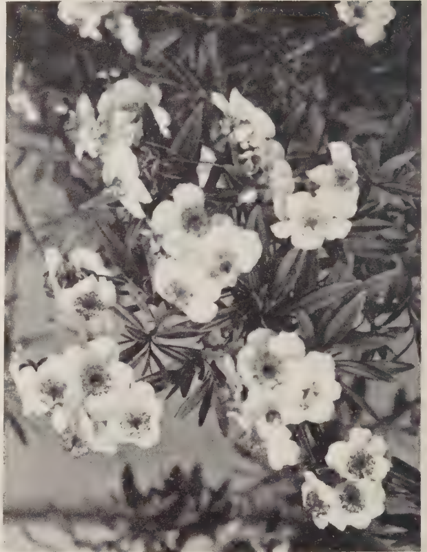
Carpenteria ( Carpenteria californica ). Very desirable for its large white fragrant flowers. See page 13.

* Antirrhinum speciosum ( Galvesia speciosa ). "Bush Snapdragon." A rare and beautiful shrub from Catalina and San Clemente Islands. Forms a much branched sprawling plant, ranging from 3 to 8 feet in height with rather small, opposite oblong leaves. Bright scarlet tubular flowers. Excellent for planting on banks near the coast. Plants on three estates in Santa Barbara have bloomed the entire year round. Gallon cans, $1.00.