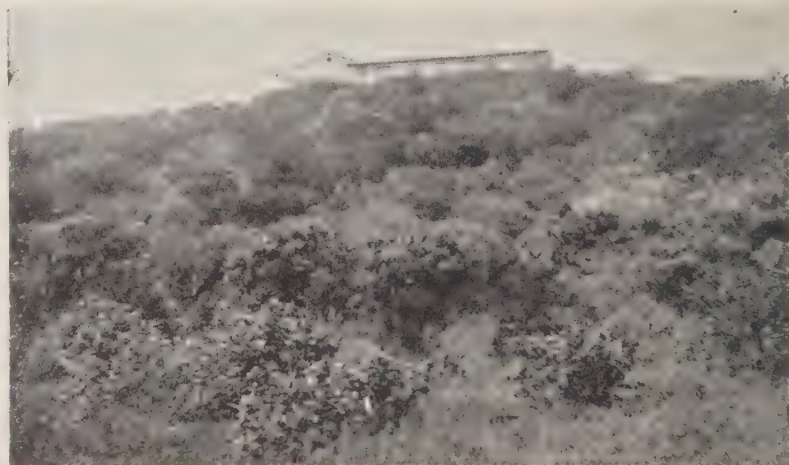
Hillside planted with native shrubs. A few years before this was bare ground. These shrubs were watered for two years, since then they have had no attention.

* Sambucus glauca . "California Elderberry." A deciduous tree with attractive light green foliage and large clusters of creamy white flowers appearing abundantly in spring and early summer. The flowers are followed by clusters of blue berries which are excellent for pies, and for making wine. Of very rapid growth and especially valuable where a quick effect is desired. While this tree is deciduous it comes out into leaf very early in the spring and drops its leaves late in the fall, so that it is only bare for a short time. Gallon cans, 85c.