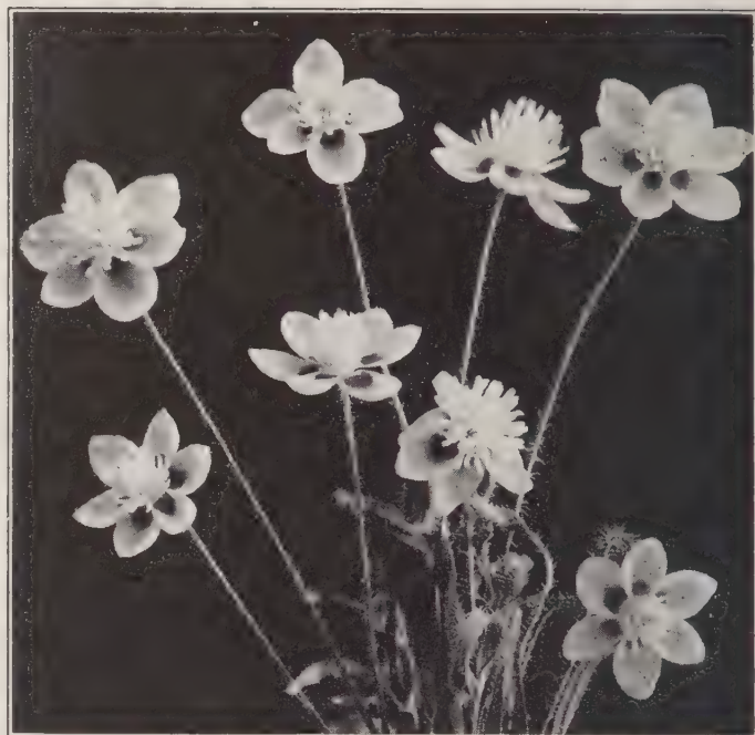
Cream Cups ( Platystemon californicus ). A charming little flower. See page 11.

* Mimulus longiflorus hybrids. Natural hybrids of various forms of Mimulus longiflorus and Mimulus puniceus which originated in our nursery a number of years ago and have since been grown extensively by the Santa Barbara Botanic Garden. The flowers are large and produced in great abundance. They come in many beautiful shades, buff, mahogany color, crimson, orange scarlet, rose shades, salmon pink, pale pink, chamois, cream-color and white. Packet, 25c.