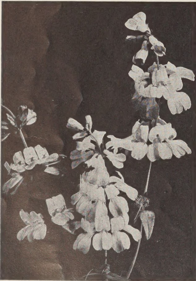
Chinese Houses ( Collinsia bicolor ). Especially desirable for shady places.

Collinsia bicolor . "Chinese Houses." "Innocence." Flowers arranged in crowded circles or tiers at intervals along the stem, suggesting the common name of "Chinese Houses." White shaded lilac and rose purple. 1 to 1½ feet. Packet, 10c; ounce, 60c; ¼ pound, $1.80; pound, $6.00.