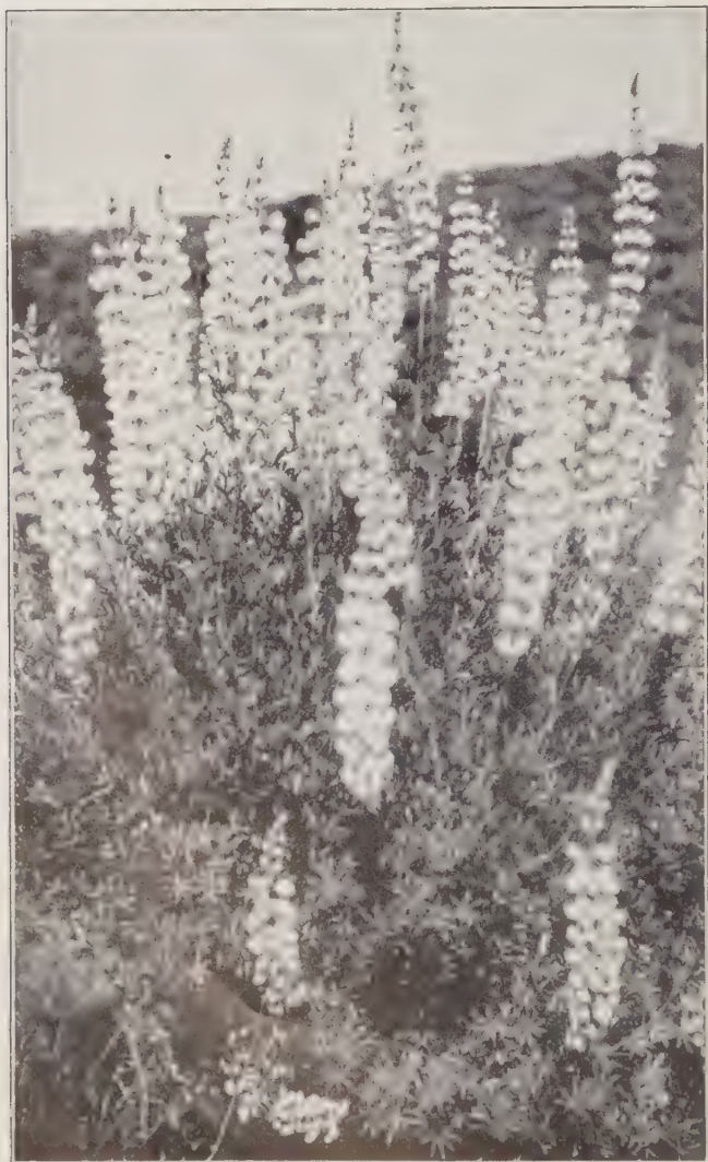
Payne's Tree Lupine ( Lupinus paynei ). Beautiful silvery foliage. One of the most attractive of the bush or tree lupines. See page 9.

* Mimulus longiflorus rutilus . "Brown Flowered Bush Monkey Flower." A form of the preceding with mahogany brown flowers. Packet, 25c.