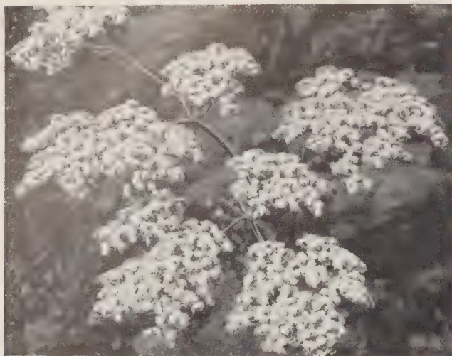
Giant Buckwheat or St. Catharine's Lace ( Eriogonum giganteum ). A striking plant which can be grown in any garden. Very decorative.

* Eriogonum arborescens . "Island Buckwheat." A rare species from Santa Cruz and Santa Rosa Islands. Forms a spreading bushy plant 2 to 4 feet high or more, with narrow, light green foliage and covered in summer with attractive, broad flat heads of rosy pink flowers. An ornament in any garden. Gallon cans, 75c.