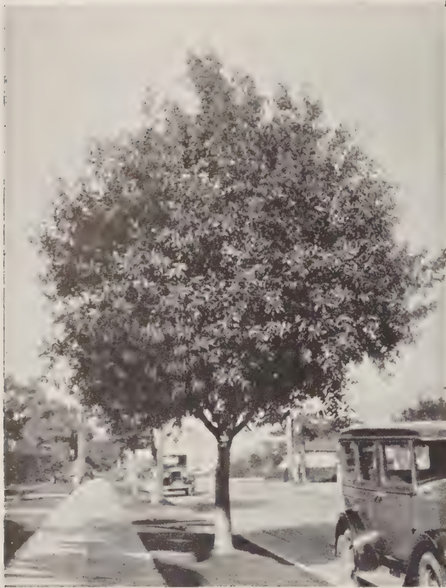
California Laurel or Bay ( Umbellularia californica ). Grown as a parkway tree, Castillo Street, Santa Barbara. See page 21.

* Symphoricarpos mollis . "Dwarf Snowberry." Low growing erect, diffusely branched deciduous shrub with roundish leaves, small pink flowers and snow-white berries. Found in shady places, the plants only growing a foot or so high, sending up many stems from the ground and soon spreading out over a large space. Excellent as a ground cover under trees. Gallon cans, 85c.