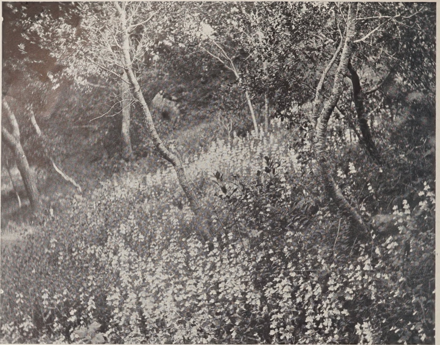
CALIFORNIA WILD FLOWERS—CHINESE HOUSES ( Collinsia bicolor ) Planted in a natural way by Theodore Payne