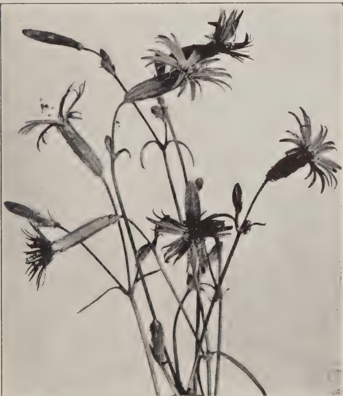
Fringed Indian Pink ( Silene laciniata ). Bright scarlet flowers. See page 11.

* Lathyrus violaceus . "Purple Pea." Perennial climber 4 to 8 feet. A beautiful plant with light green foliage and pale, violet purple flowers. Packet, 25c.