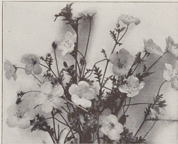
Baby Blue Eyes ( Nemophila insignis ). Will grow in shade or sun. See page 6.