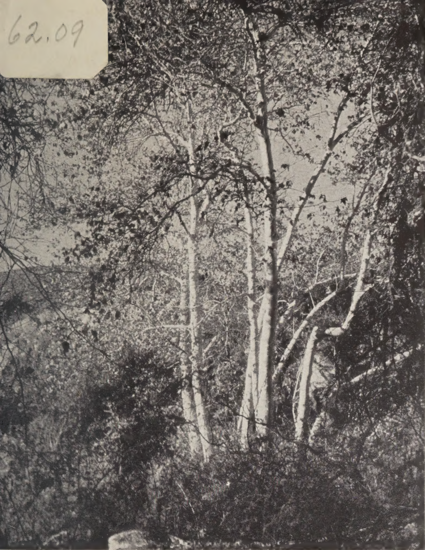
CALIFORNIA SYCAMORES