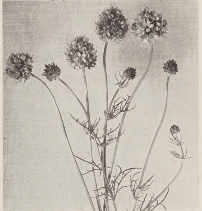
Large Blue Gilia ( Gilia achillaefolia ). Large heads of bright blue flowers. See page 4.

* Godetia dudleyana . "Dudley Godetia." Words are inadequate to describe the delicate beauty of this flower. The color is a very soft orchid shade, flecked with reddish-purple on the lower portion of the petals. Very attractive in the garden and