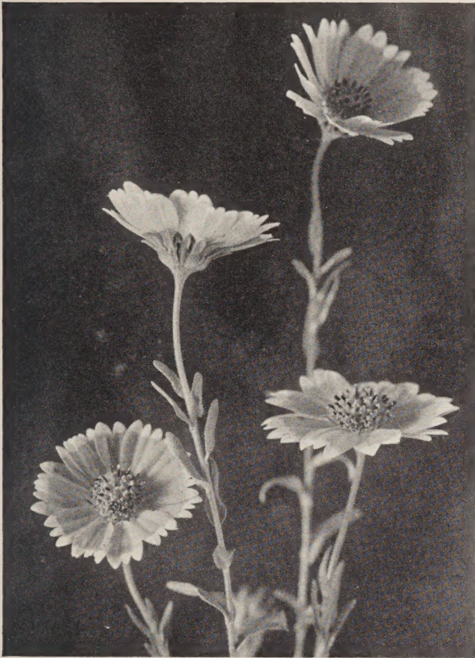
Tidy Tips ( Layia platyglossa ). Especially attractive in masses. See page 6.

* Gilia multicaulis . "Blue Gilia." Violet blue flowers in rather dense heads on graceful, slender stems. Light green, finely cut foliage. There are many variations of this species, but this is an extra good form found in one particular locality. Blooms earlier than the two preceding kinds. 1 to 1½ feet. Packet, 15c; ounce, 80c; ¼ pound, $2.50.