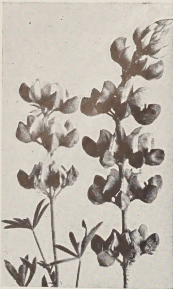
Dwarf Blue Lupine. See page 6.