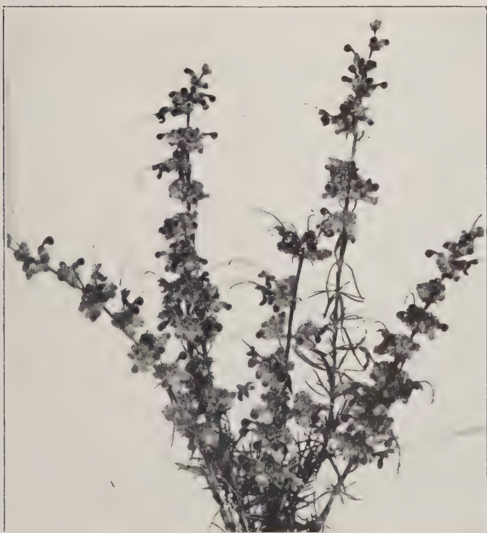
Woolly Blue Curls or Romero ( Trichostema lanatum ). Desirable for its long spikes of attractive flowers. A good subject for dry hot slopes. See page 21.

* Rhamnus crocea . "Red Berry." A rather small dense growing shrub with small, bright glossy green foliage. Small whitish green flowers followed by bright red berries in the summer. Creates a pleasing effect when planted around rocks or against a wall. Makes an excellent hedge plant and stands trimming well. Thrives under ordinary garden culture and is one of the most desirable of the native shrubs for foliage effect. Gallon cans, $1.00; 5-gallon cans, $2.50.