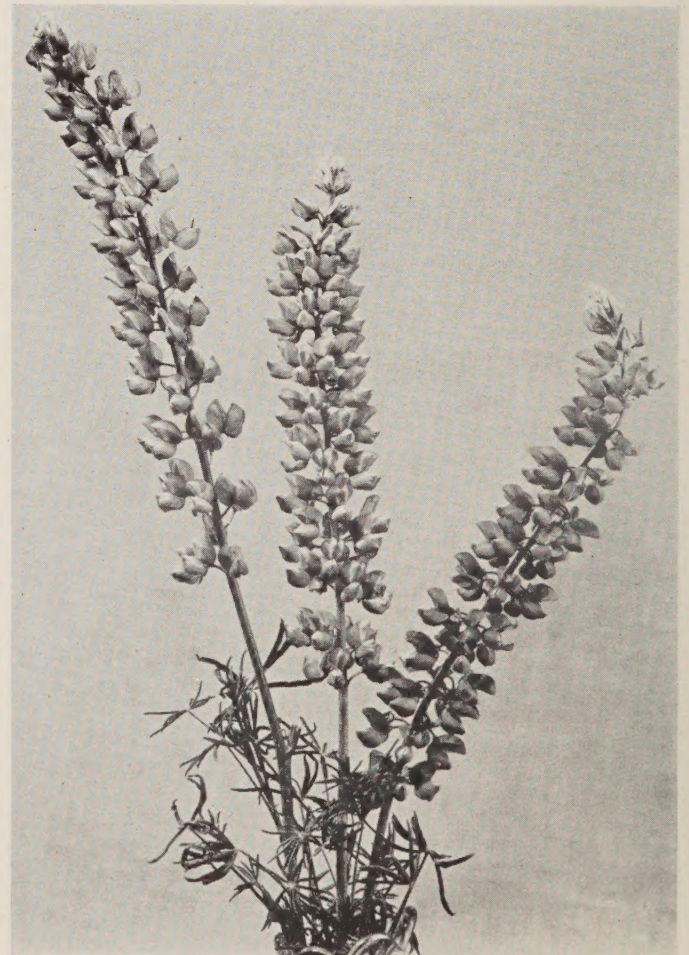
Bentham's Lupine ( Lupinus benthamii ). One of the finest of the lupines. See page 9.

* Geraea canescens . "Desert Gold." "Desert Sunflower." Annual, 1\frac{1}{2} to 3 feet high. Flowers deep golden yellow, very showy and very fragrant; excellent for cutting, lasting a long time in water. In the coastal areas sow the seed in spring. Packet, 15c.