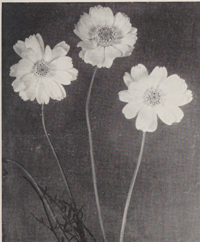
Yellow Daisy—Douglas Coreopsis (— Coreopsis douglasii ). Very pretty in masses.

* Baeria gracilis . "Sunshine," "Gold Fields." Annual 4 to 8 inches high. Golden yellow star-shaped flowers very attractive in masses. Packet, 15c.