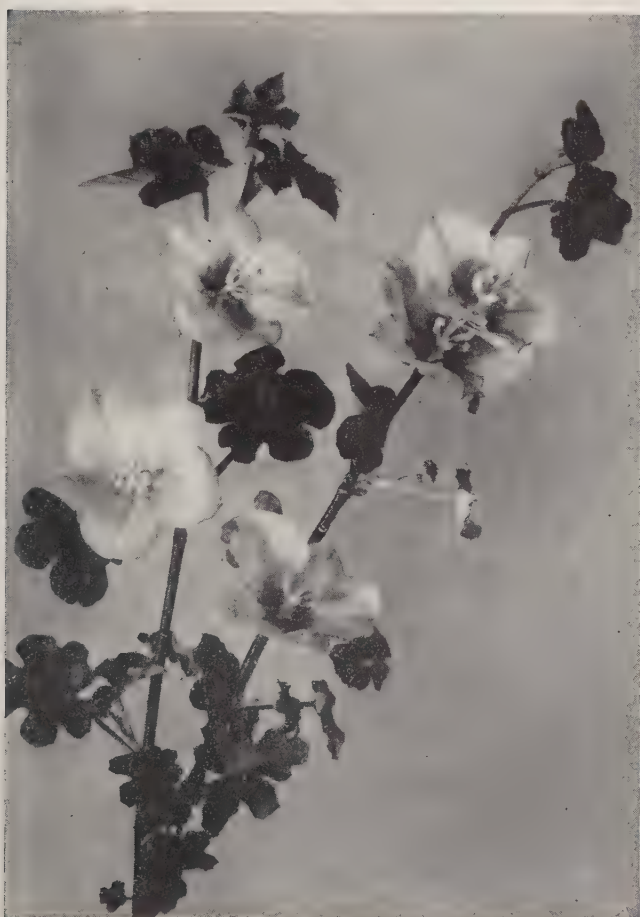
Southern Fremontia ( Fremontia mexicana ). From San Diego County and Lower California. Produces quantities of large yellow flowers. One of the most popular of the native shrubs.

* Cercocarpus betuloides . "Mountain Mahogany." Graceful arching branches with small wrinkled leaves of rich deep green. Flowers small, pale yellow, rather inconspicuous, but followed by interesting feathery tailed seeds. Rapid in growth, thriving in either sun or shade, making a very cheerful appearance in all stages of its growth. One of the most useful of the native shrubs, excellent for foundation planting against a wall or building and can be used to great advantage in a shrubby group. Will grow with very little water, at the same time water does not seem to hurt it, and it will stand ordinary garden culture. Gallon cans, 85c.