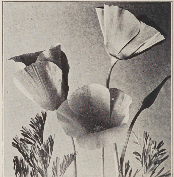
California Poppy ( Eschscholtzia californica ). Most brilliant of all the wild flowers.