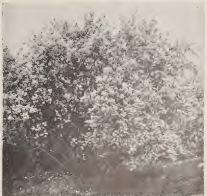
Red Heart Lilac ( Ceanothus spinosus ). On Mrs. C. M. Pratt estate, Ojai, Calif. Large spikes of light blue flowers. One of the most free flowering of the California Lilacs. See page 14.

Carpenteria californica . "Carpenteria." A rare and beautiful shrub of erect habit, with many stems from the base growing to a height of 3 to 7 feet. Leaves rather narrow, smooth, dark green. Flowers in clusters usually 5 to 7, but occasionally 12 or more; large pure white, with yellow stamens and with a fragrance like the mock orange. Will stand a fair amount of water but requires good drainage and does best with a little shade. Gallon cans, $1.25; 5-gallon cans, $3.00.