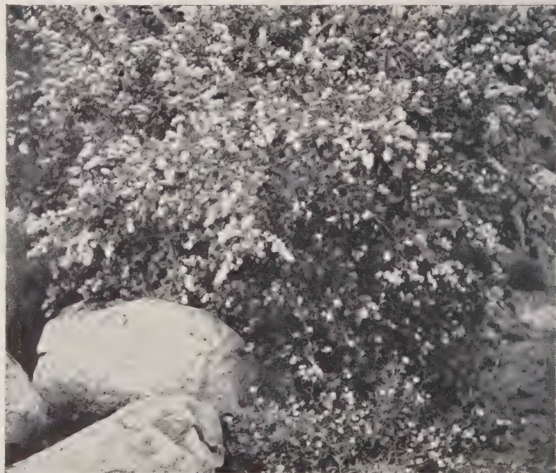
Seacliff Lilac ( Ceanothus thyrsiflorus griseus ). In Santa Barbara Botanic Garden. One of the best of the California Lilacs for general use.

* Cephalanthus occidentalis "Button Bush." "Button Willow." A handsome deciduous shrub, 6 to 20 feet high, with bright green foliage and white, fragrant flowers in spherical heads resembling pincushions. Grows along streams and in wet places. Gallon cans, 85c.