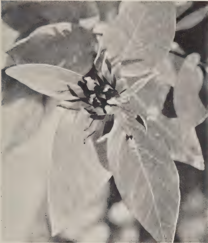
California Sweet-Scented Shrub ( Calycanthus occidentalis ). A good subject for a moist shady location.