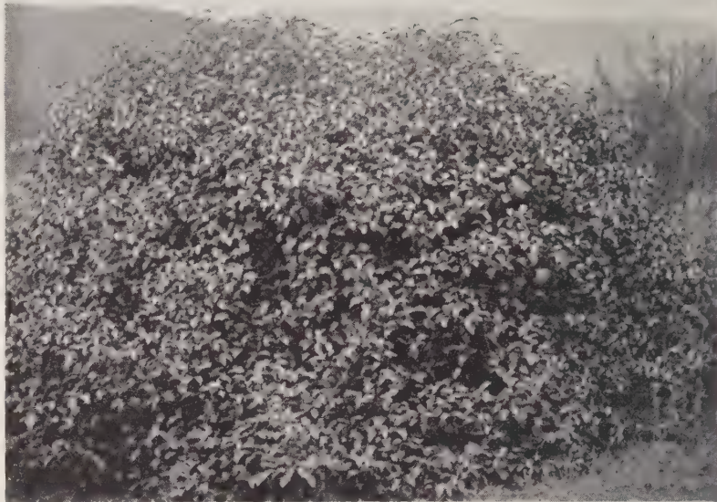
Sugar Bush ( Rhus ovata ). In Santiago Canyon, Orange County. This shrub is growing in the dry wash and has never had any water other than the natural rainfall. See page 19.