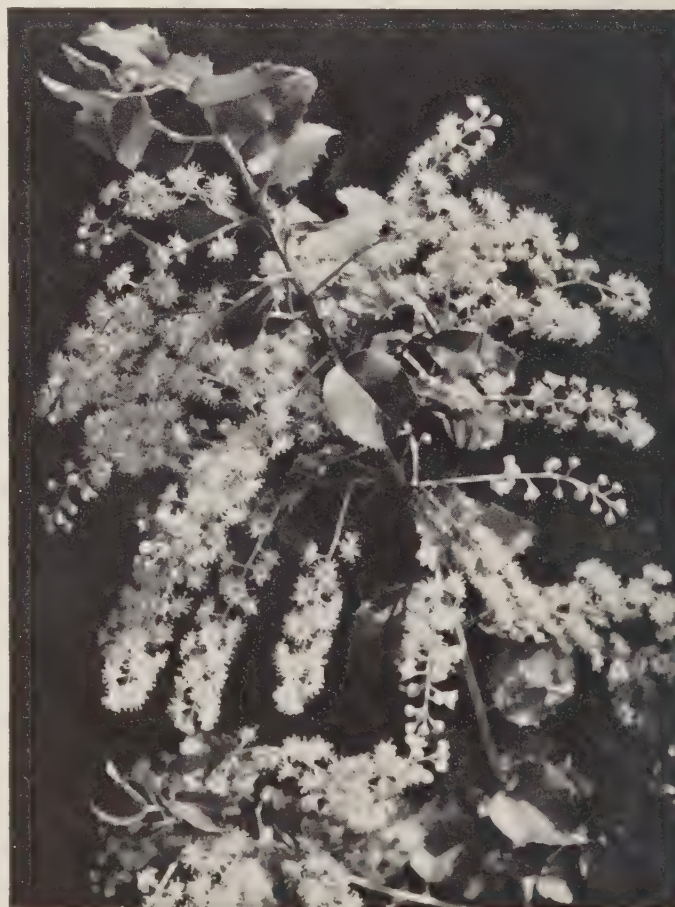
Hollyleaf Cherry ( Prunus ilicifolia ). One of the most useful of the native shrubs. Desirable for foundation planting against a building. Makes a splendid hedge. See page 18.

* Gilia californica . "Prickly Phlox." Erect growing widely branched shrub 2½ to 4 feet high. A most charming plant seen growing on many of our dry hillsides. Stems covered with short prickly needle-like leaves. Flowers fragrant, in clusters resembling the phlox in shape, of a delicate shade of rose-pink and of texture like the finest silk with an exquisite sheen. Free blooming and one of the most beautiful of the native flowering shrubs. Gallon cans, 85c.