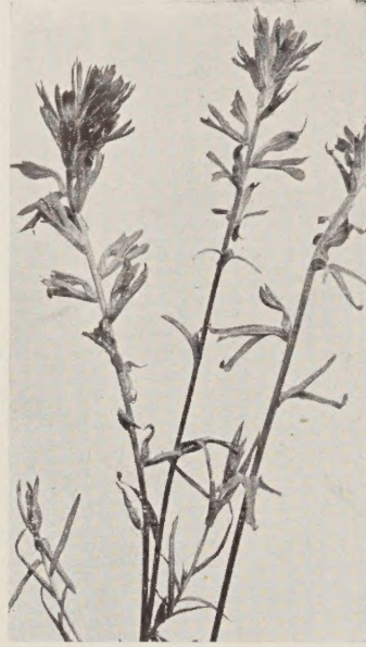
Indian Paint Brush. See page 7.