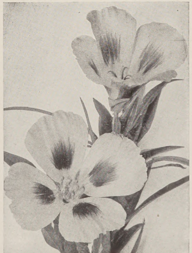
Large Flowered Godetia ( Godetia grandiflora ). One of the most beautiful of the late flowering wild flowers.

* Godetia viminea . "Orchid Flowered Godetia." Upper half of petals delicate orchid with darker blotch, lower half white, often with lilac ring at base; very delicate coloring. 1½ to 2½ feet. Packet, 15c; ounce, $1.00.