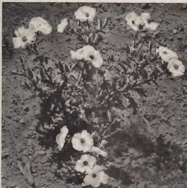
Matilija Poppy ( Romneya coulteri ). The queen of California wildflowers. See page 19.