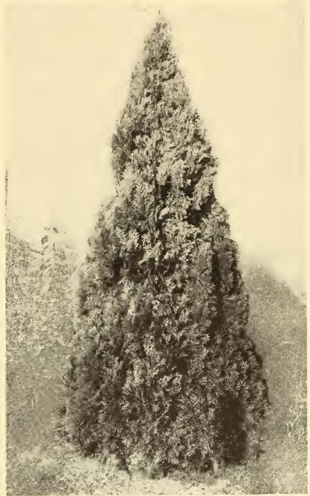
THUYA ORIENTALIS AUREA CONSPICUA

THUYA OCCIDENTALIS WOODWARDII (Woodward's Globe). A more compact and perfect shape than Globosa .