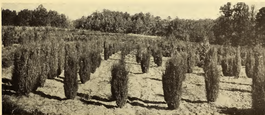
FIELD OF JUNIPERS GROWING ON OUR NURSERY