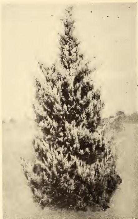
JUNIPERUS VIRGINIANA GLAUCA

JUNIPERUS CHINENSIS COLUMNARIS (Blue). A new variety introduced by the Department of Agriculture. In habit of growth it resembles the well known Italian Cypress, is perfectly hardy and retains its color effect in the winter.