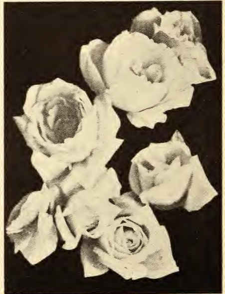
ALEXANDER HILL GRAY

CL. SUNBURST (C. H. T.) An exact counterpart of the bush form but a very vigorous grower.