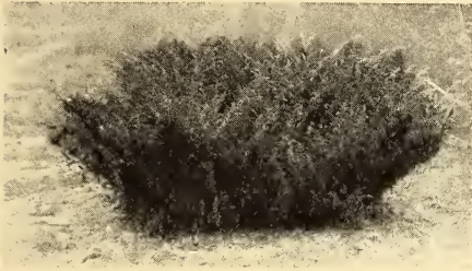
JUNIPERUS COMMUNIS DEPRESSA