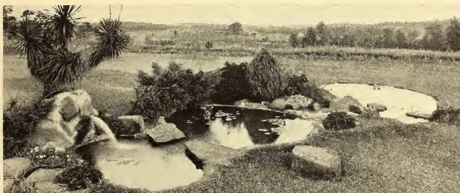
ARTIFICIAL LILY POOL, WATER FALL AND ROCK GARDEN