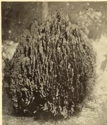
BIOTA AUREA NANA