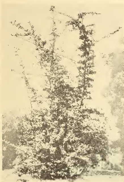
PYRACANTHA COCCINEA LALANDI

RHODODENDRONS are the most magnificent of all evergreen shrubs. Their large trusses of brilliantly colored flowers are unsurpassed in beauty. Like many other desirable things, they are not the easiest to be had; for the rhododendron is particular about the conditions under which it will grow. It prefers the moist air of the mountains which we cannot duplicate here, but it will grow well for us if we provide everything else it wants; partial shade, an acid soil rich in leaf-mould and humus and free from lime; moisture at all times, but good drainage; and a very heavy mulch of leaves or peat moss, which is best. Acidity of soil may be produced by sprinkling aluminum sulphate on the ground. The roots are close to the top of the ground and must not be disturbed by hoeing.