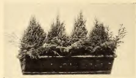
BOX PLANTING OF CONIFEROUS EVERGREENS

through winter. Foliage deep green turning red. A very attractive plant.