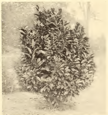
LAUROCERASUS OFFICIALIS (English Laurel)

NADINA DOMESTICA. The flowers are white followed by bright red berries which persist all