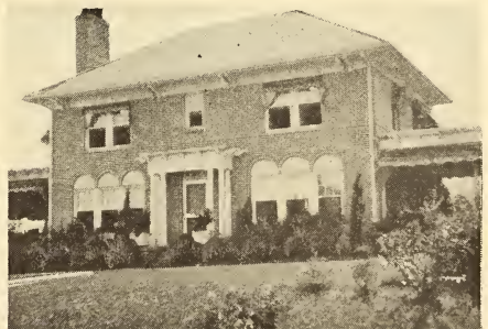
"IT'S NOT A HOME 'TIL IT'S PLANTED"

White waxy berries, does well in poor sandy soil, almost an evergreen.