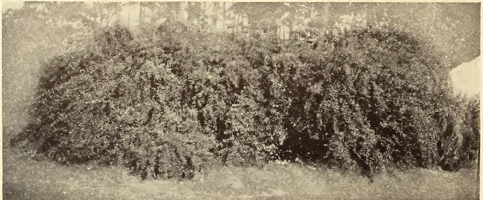
GROUP OF SPIREA THUNBERGII

VIBURNUM PLICATUM (Japanese Snowball). This plant has an upright bushy growth and very pretty foliage. The flowers come in large round white heads.