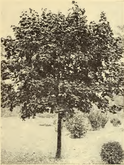
NORWAY MAPLE ( Acer Platanoides )

Shade trees are always an attractive setting for the home. They are necessary, too, to add cool comfort to the hot summer days. As an investment, they always add considerably to the renting or selling value of a place. It is the trees and flowers around the house that give it environment and atmosphere and make it home. Trees do not wear out like other things; they constantly increase in value. There's a tree at your house, tied to old memories, that you wouldn't part with; plant others; your children will be glad of those old memories later.