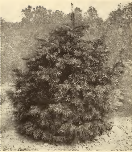
ABIES CONCOLOR (White Fir)