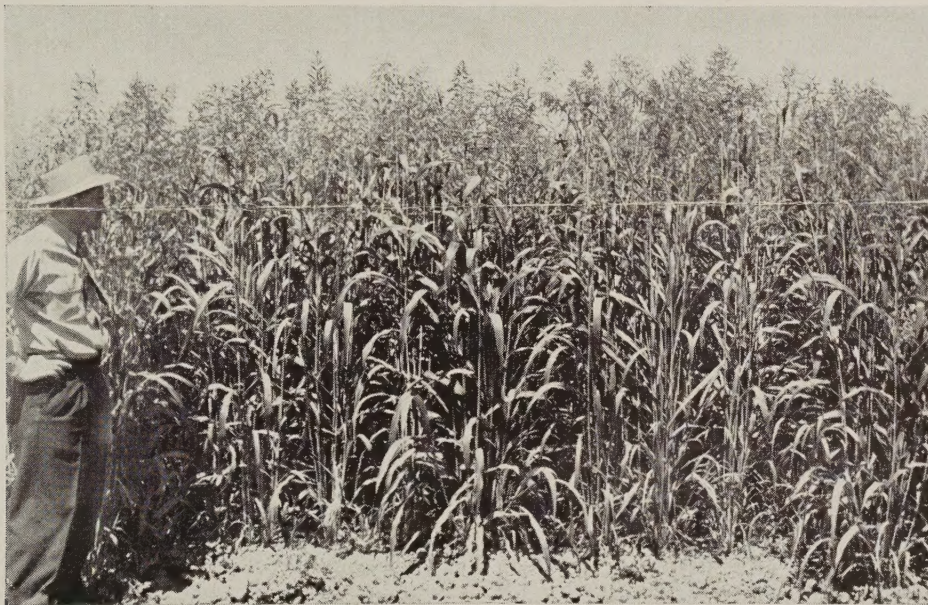
A FIELD OF SWEET SUDAN

SEED DESCRIPTION: The distinctive sienna or reddish brown seed color of Sweet Sudan permits ready detection of Johnson Grass contamination and distinguishes it from other varieties of Sudan Grass. However, Sweet Sudan seed may have a small percentage of chocolate, mahogany, purple, or red Sudan seed and still be Sweet Sudan. At present plant breeders have not completely eliminated the dominant darker colors and genetical purity is not completely stabilized.