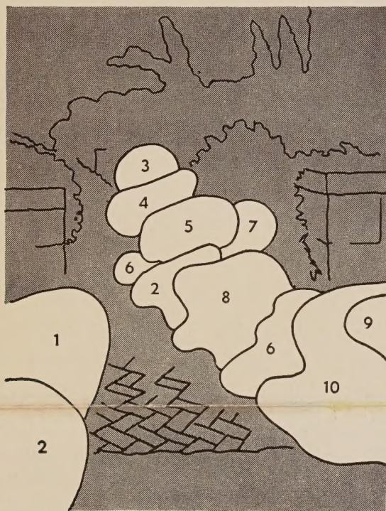
Key to chrysanthemums shown in color on opposite page. Photographed by Suter, Hedrich-Blessing at Wychwood, Lake Geneva, Wisconsin