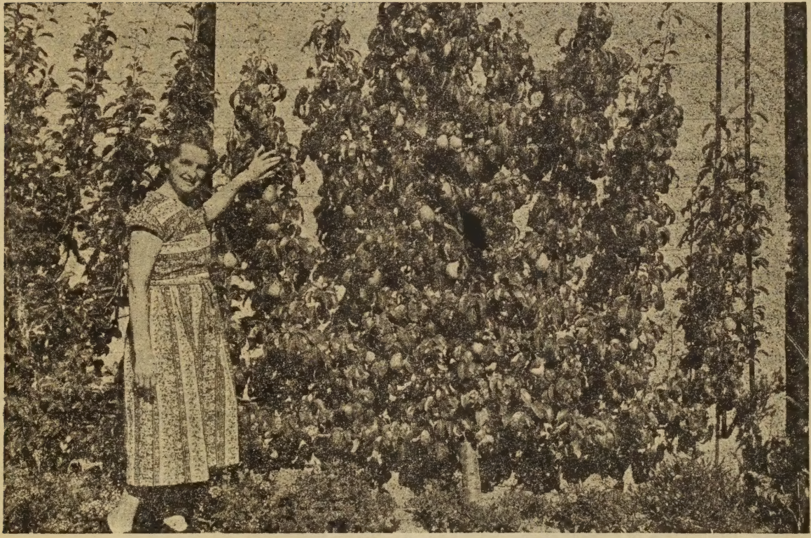
Lots of fruit on Dwarf and Espalier Trees.