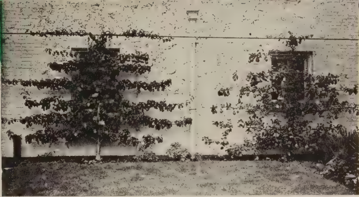
Above: Eight-year-old Espalier pear trees planted against a garage. Note heavy crop of large pears.