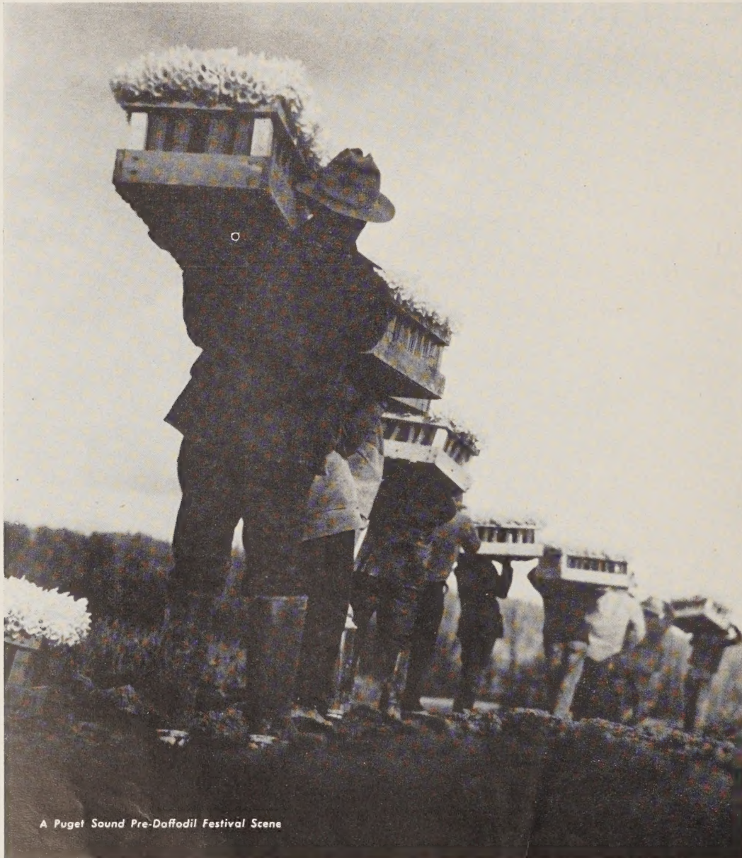
A Puget Sound Pre-Daffodil Festival Scene

It is with considerable pride that we offer one of the finest and most complete stocks of Northwest Narcissi, grown literally at our "back door". We have brought together, to the best of our ability, many varieties suited for the best retail trade and for greenhouse forcing. Our stock of novelties is unusually wide. Our classification of types follows that of the Royal Horticultural Society of England, the standard one adopted throughout the trade. We use the term "Narcissus" as an all-inclusive one to include Daffodils.