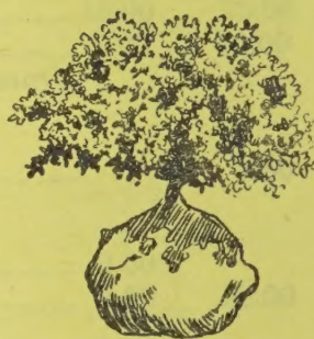
Berberis nana (Natural Shape)

This is a low, slow growing and compact sport of the well known hardy Barberry. It's compact, tight growth makes a trim appearance without shearing. This plant never gets out of hand as do common Barberry plants and the foliage is better than that of the parent and it has the same kind and color fruits. Its appearance is somewhat like that of a dwarf Holly or Azalea. It is undoubtedly the best permanently dwarf deciduous plant for low hedges and borders because of its dwarfness, hardiness and general permanence.