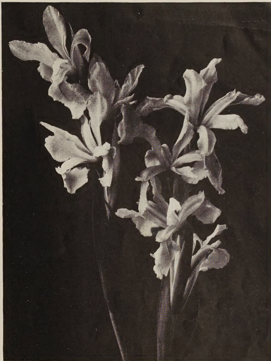
OCHROLEUCA IRIS (SPURIA)