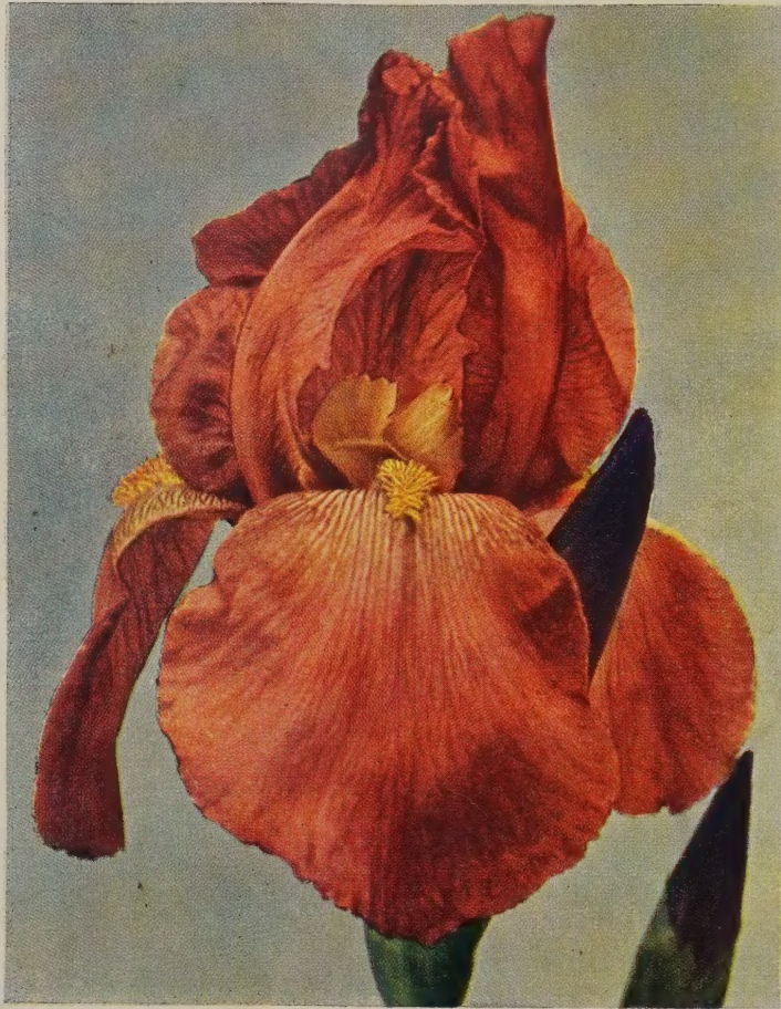
BRYCE CANYON (above) BLUE SHIMMER (below)

POSTMASTER: Return Postage Guaranteed. If addressee has removed and new address is known, notify sender on FORM 3547 Postage for which is guaranteed.