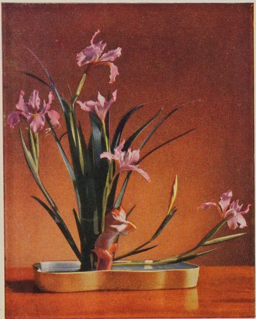
Douglasiana Iris, Orchid Sprite