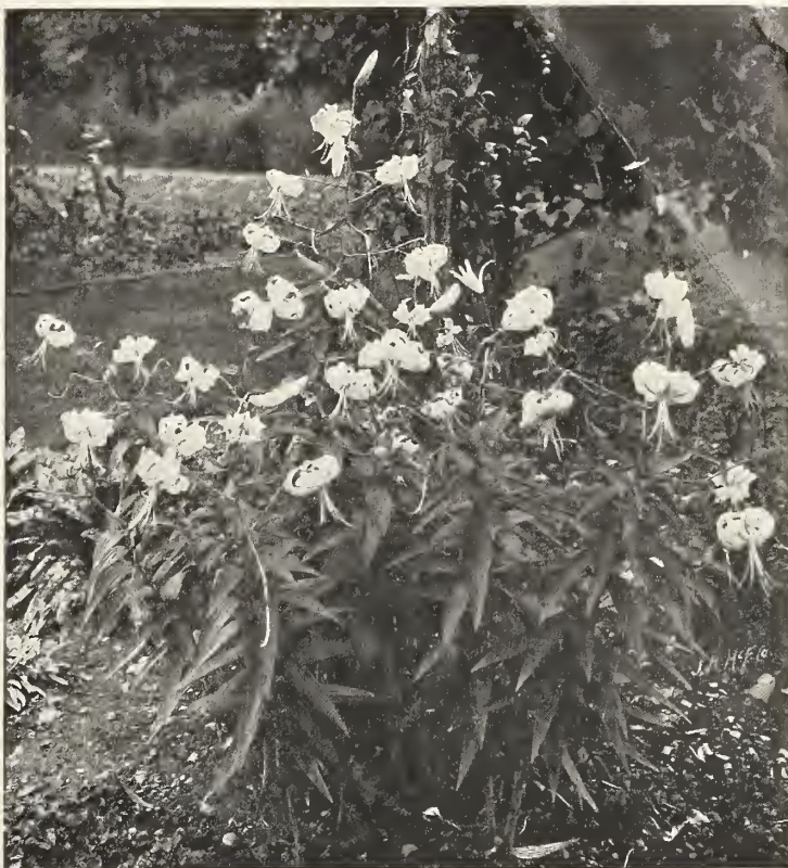
Lilium speciosum album.