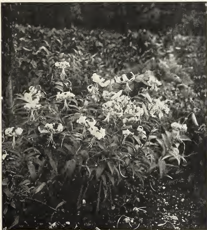
Lilium speciosum rubrum.