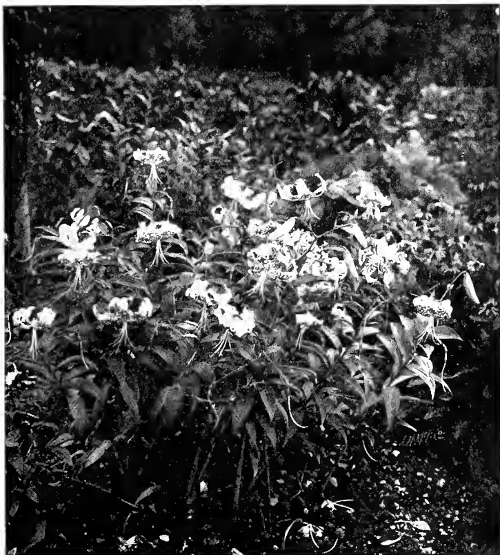
Lilium speciosum rubrum.