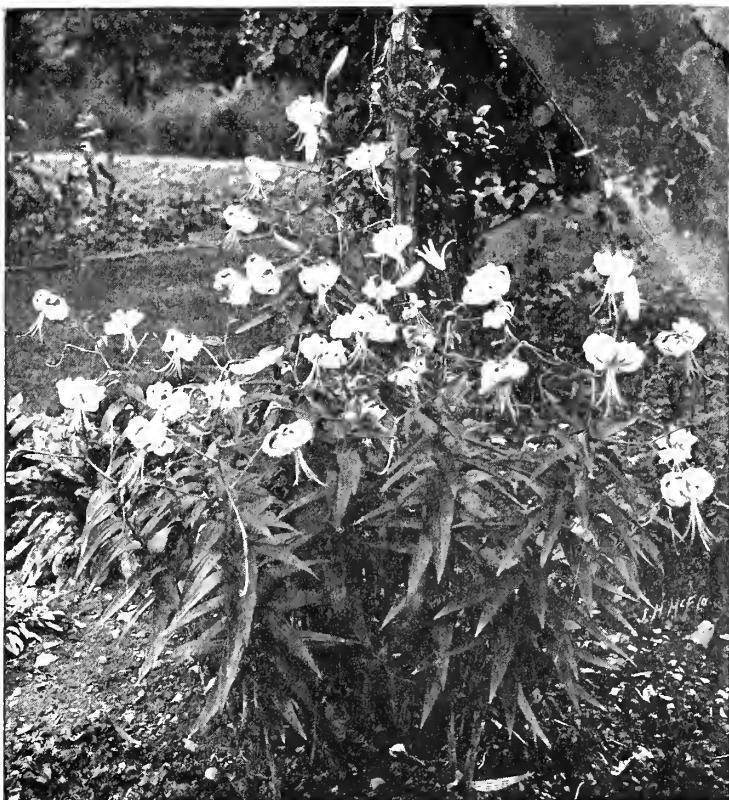
Lilium speciosum album.