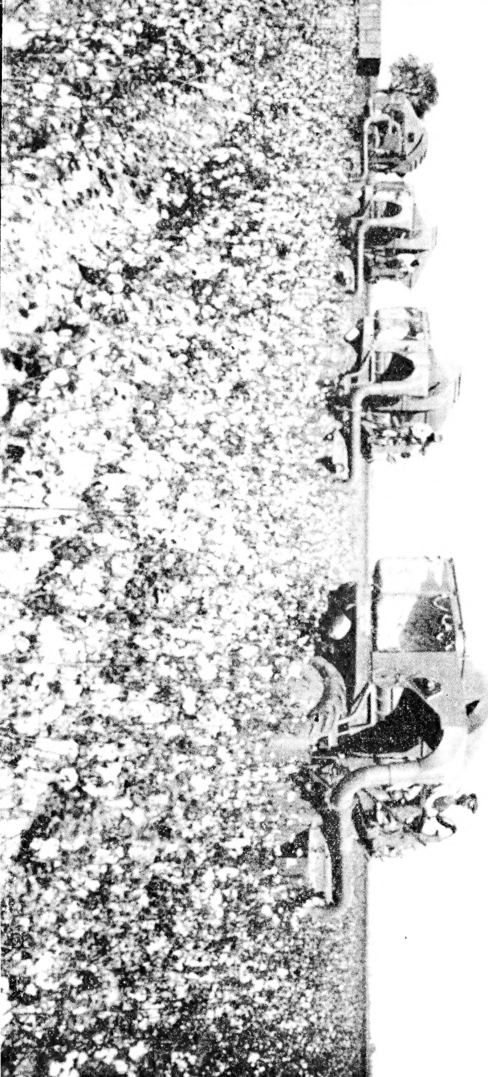
Men and children working on the Henson Planting Com- pany plantation, Clifton, Me., Sept. 9, 1936, only one of the plantations.