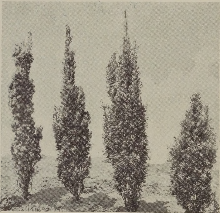
Taxus Media Sentinalis

We think it will be profitable for you to have a fair supply on hand when they become as well known to the general public as some of the present "stand-bys". Prepare now for these future demands.