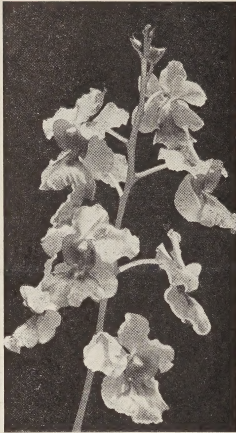
A nice spike of Vanda Miss Agnes Joaquim at the Orchid Jungle. While only eight flowers were open at once the spike produced 32 flowers in all. This is the easiest grown of all outdoor orchids.

This should make a winter flowering, dark, large Cattleya with free growing and flowering habits. Ready Feb-March. Both parents highest quality.