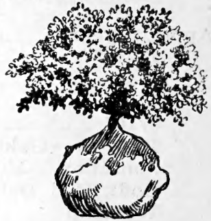
Berberis nana (Natural Shape)

This is a low, slow growing and compact sport of the well known hardy Barberry. It's compact, tight growth makes a trim appearance without shearing. This plant never gets out of hand as do common Barberry plants and the foliage is better than that of the parent and it has the same kind and color fruits. Its appearance is somewhat like that of a dwarf Holly or Azalea. It is undoubtedly the best permanently dwarf deciduous plant for low hedges and borders because of its dwarfness, hardiness and general permanence.