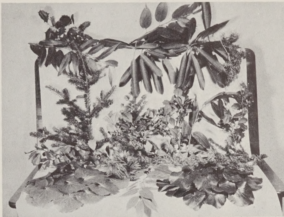
Bearing the fragrance of Balsam and Pine, the color of Galax and Holly

I am sure that you and your friends will be delighted with this unusual token of regard at the holiday season.