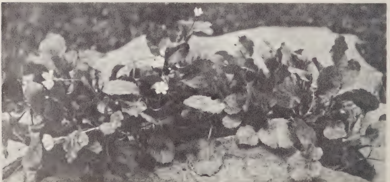
SHORTIA GALACIFOLIO. OCONEE-BELLS