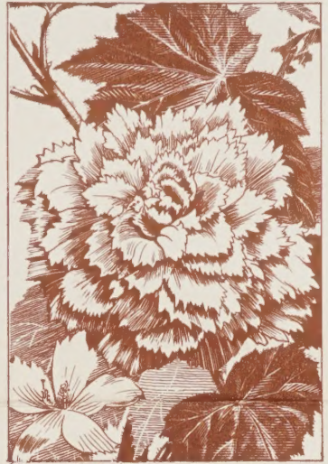
CARNATION ( Fimbriata Plena )

DOUBLE CAMELLIA TYPE —The largest and most popular of all the double types. Individual flowers from 5 to 8 inches in diameter.