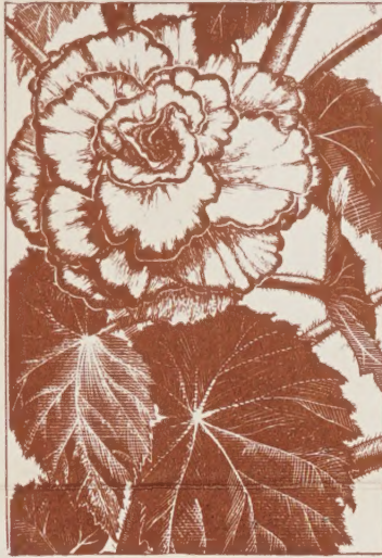
PICOTEE ( Camellia Marginata )