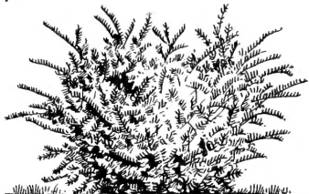
Spreading Japanese Yew