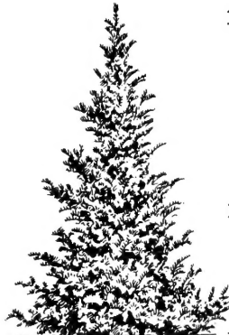
Upright Japanese Yew

12/15" 3.75 15/18" 4.25 18/24" 5.75 2/2½' 7.50 2½/3' 10.00 3/3½' 12.50