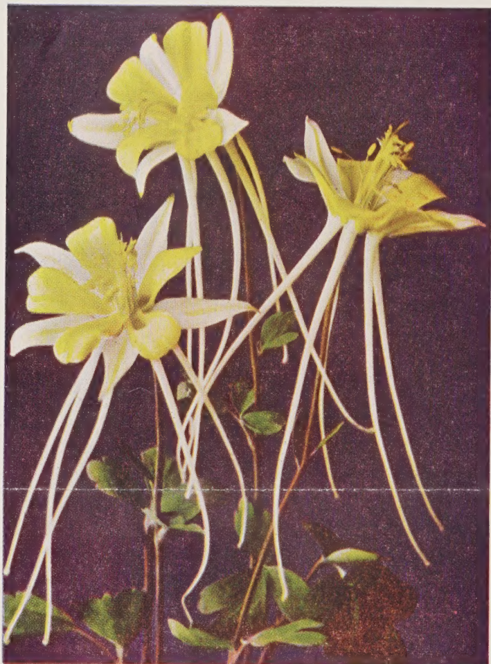
AQUILEGIA LONGISSIMA (COLUMBINE)

New, lower prices: 50 for $1.75, prepaid. 100 for $3.00, prepaid. 500 for $8.00, express collect. 1000 for $15.00, express collect.