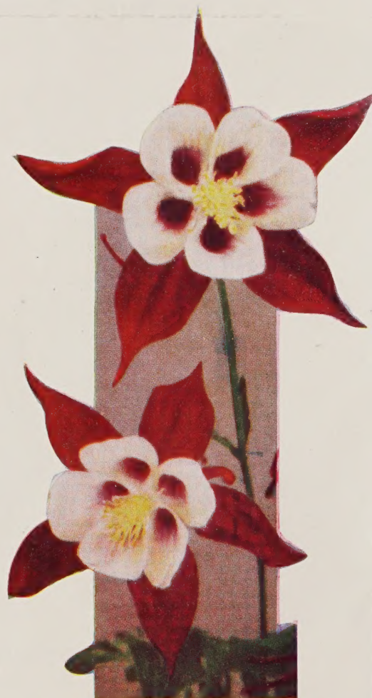
AQUILEGIA CRIMSON STAR

Strong one year old plants, 35 cents each, $3.50 per dozen, prepaid.