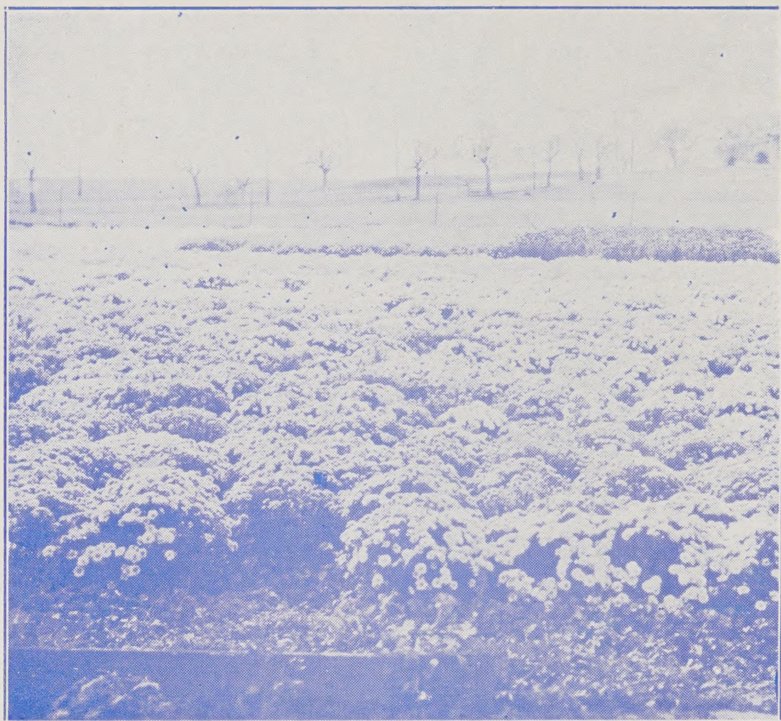
Partial View of Our Stock Plants