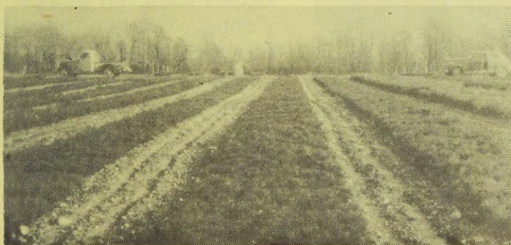
4 YEAR EVERGREEN TRANSPLANTS