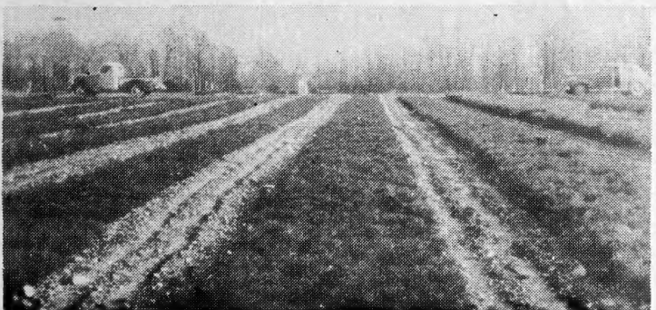
4 YEAR EVERGREEN TRANSPLANTS