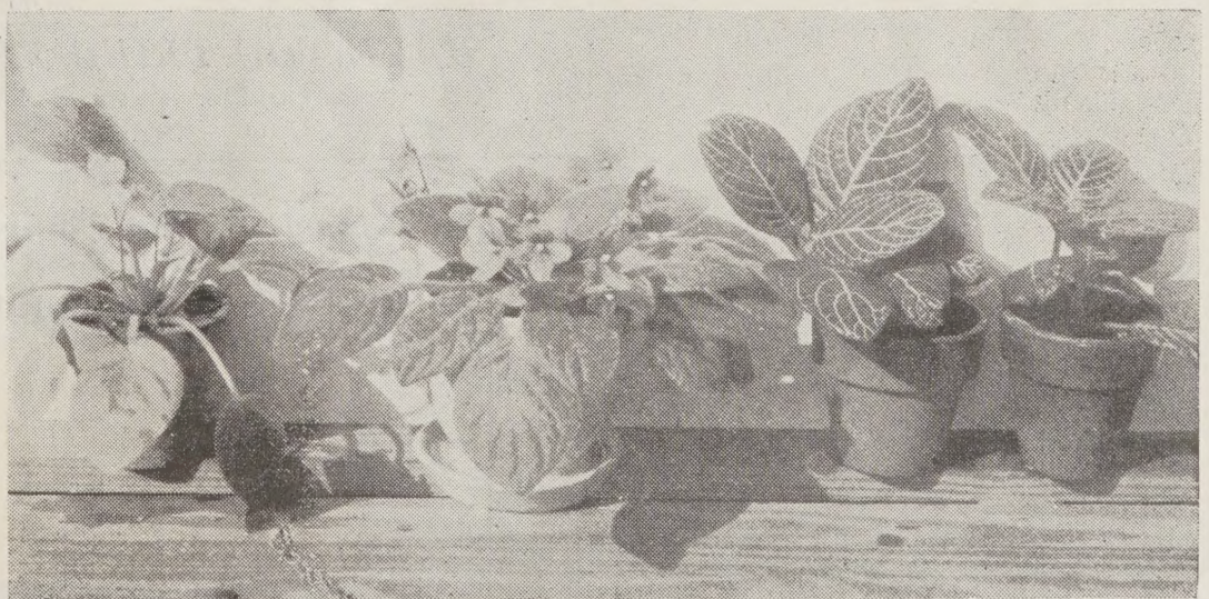
Left to Right—No. 1—African Violet ( Blue Boy ) in 3" pot as regularly supplied. No. 2—African Violet ( Amethyst ) in Haeger Pottery Planter. No. 3— Fittonia Argyneura in 3" pot. No. 4— Fittonia Verschaffeltia .

Among orchids we have had in bloom during the last month which merit more than casual attention have been Brassavola digbyana alba which took a first prize in Fifth International Orchid Show in Miami in February 1949. C. Lueddemanniana which took first prize for the best cattleya species in the 1950 show, a specimen plant of D. Sanders' Crimson dark var. which won a Certificate of Cultural Achievement in March from the South Florida Orchid Society, Renanthera Storei , with a gorgeous spike of red blooms, a plant of C. gigas with two spikes of seven flowers each and another spike of four in a 7" pan, Vanda Dearei Cyp. Mme. Martinet with two pink flowers, C. Superba with 11 brilliant blooms on 3 spikes, several B200s with 4 "fancy" blooms per spike, Ble. The Baroness , two fine varieties of Laelia tenebrosa , Aerides odoratum , D. Formosum Giganteum , Renanthera coccinea , Vanda Merrillii , V. Hookeriana , and many new and as yet unnamed Vandas and Cattleyas .