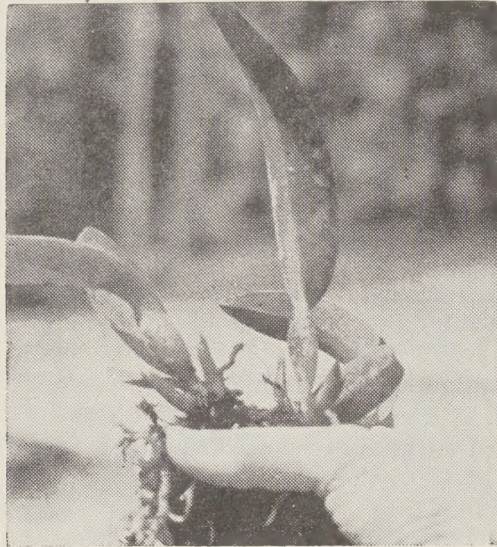
Two strong young plants from a tray—Ready for 3" pots—Notice the two strong growths on each another result of regular feeding with FENORCO PLANT FOOD.