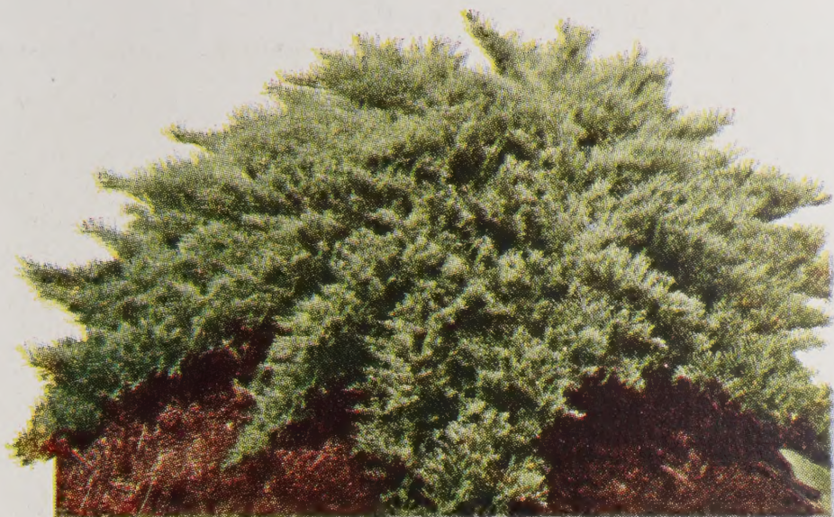
JUNIPER, TAMARIX SAVIN

A low-spreading evergreen, having many fine needles of bluish green.