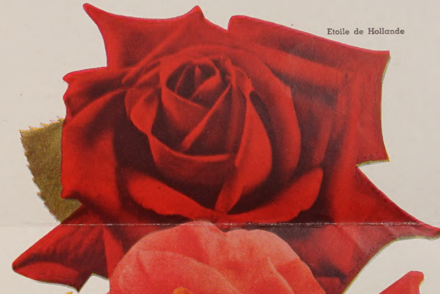
Etoile de Hollande