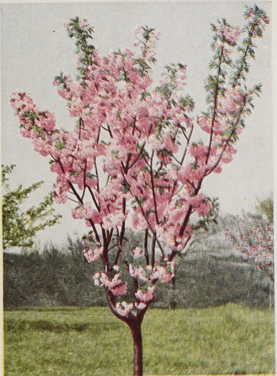
Hopa Flowering Crab