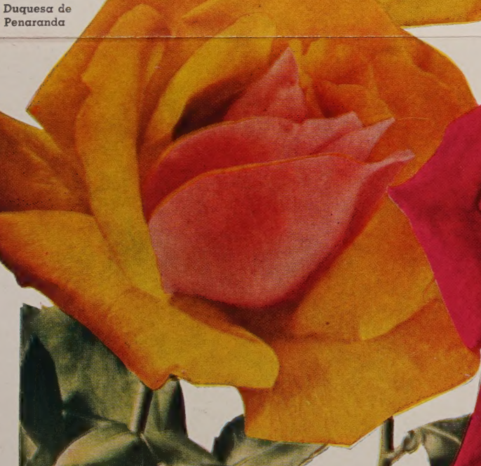
Duquesa de Penaranda