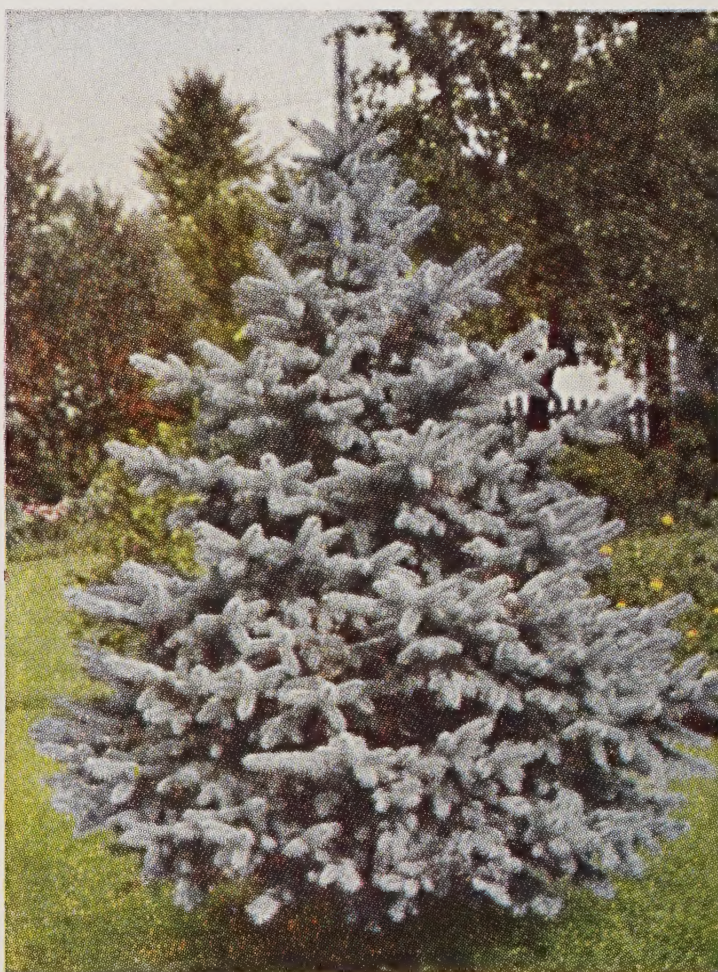
COLORADO BLUE SPRUCE

The most popular low-growing spreading evergreen. Attractive blue-green foliage. Grows rapidly and does well in sun or shade.