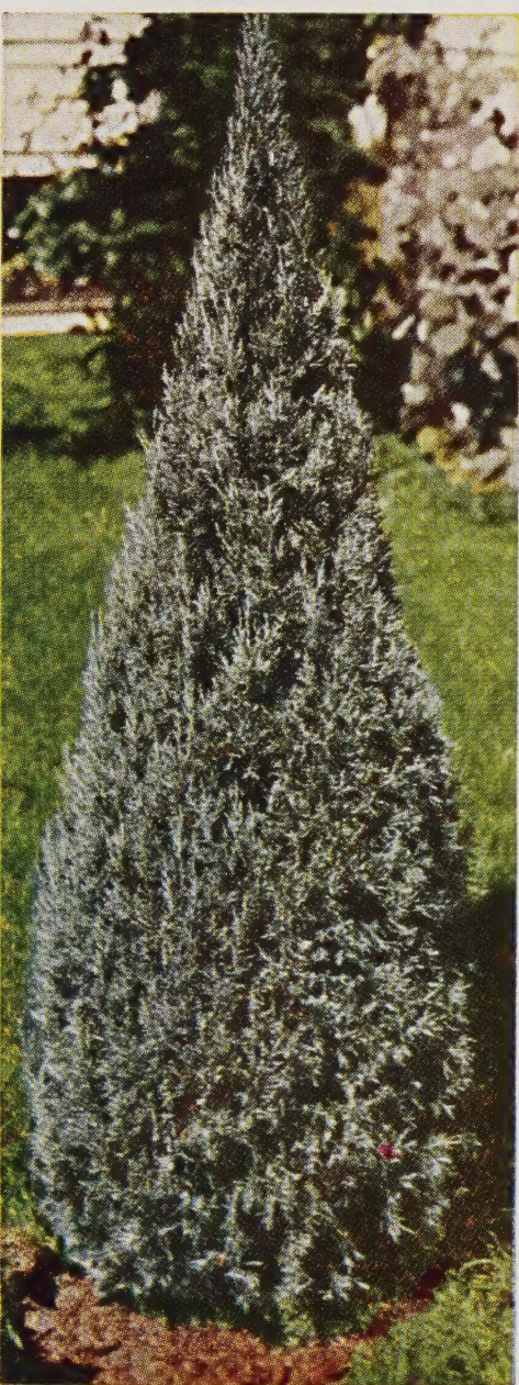
JUNIPER, STUHR'S SILVER

SEE ENCLOSED LIST FOR PRICES ON ALL ITEMS