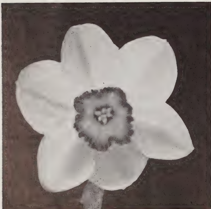
Barrii Narcissus, "LADY DIANA MANNERS"

DIANA KASNER. (3b) One of the most valuable show varieties. Pure white perianth with a large fluted yellow cup—frilled blood-red. Very free flowering. $1.65 for 10; $14.00 per 100.