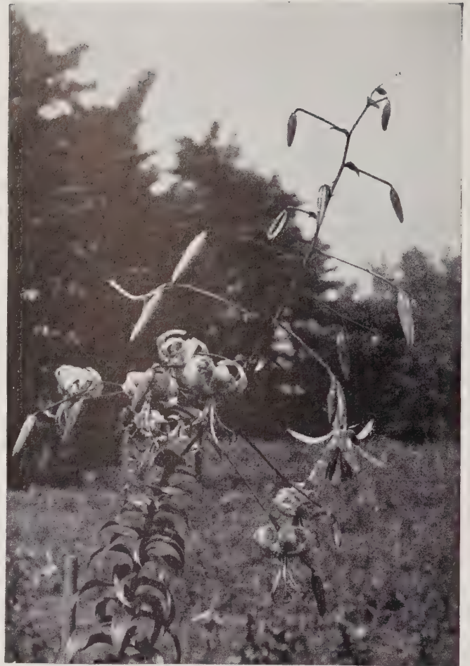
Lilium, HENRYI "JOHN T. SCHEEPERS"