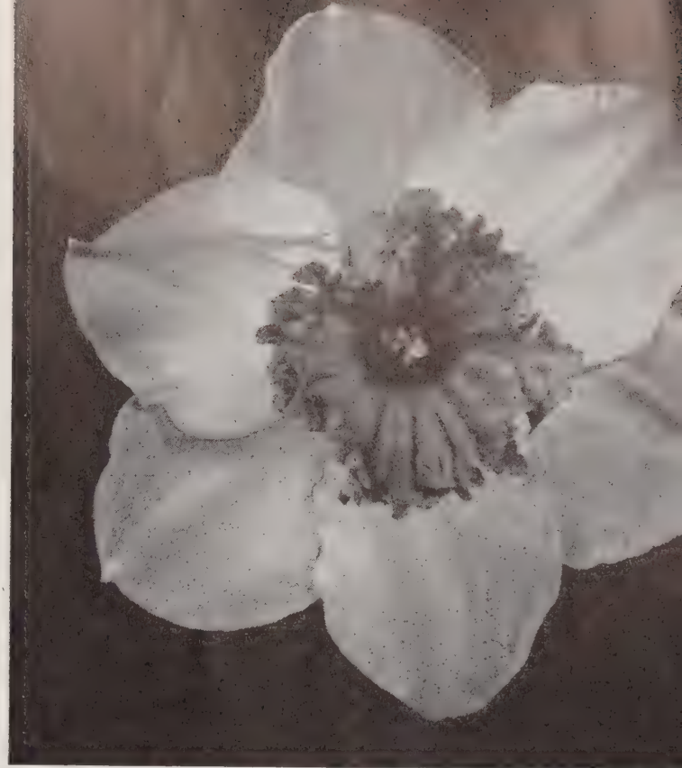
Incomparabilis Narcissus "JOHN EVELYN"

DICK WELLBAND. (2b) One of the finest of recent introductions. Very strong grower and exceptionally free-flowering. The perianth is pure white and the cup a brilliant flame-orange. The color does not fade but rather intensifies with age. The flower has unusual lasting qualities. Its greatest beauty lies in the startling contrast between petals and cup which makes it stand out even in the largest collection of Daffodils. An exhibition variety "par excellence." $1.90 for 10; $16.50 per 100. See illustration, next page.