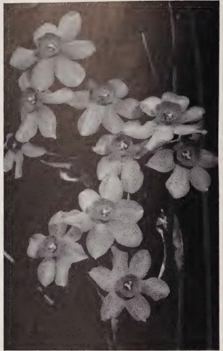
Jonquilla Hybrid, "SIMPLEX"

GOLDEN SCEPTRE. Standard-bearer of the new type of hybrid which has become so popular because it is so much more gracefully proportioned than the giant Trumpet. A medium-sized perfectly built flower of deep Jonquil-yellow, 3 inches or so in diameter, the perianth star-shaped, just a shade lighter in coloring than the Trumpet, which is slightly rolled and flaring at the mouth like a miniature Trumpet. The entire flower is of the greatest substance, keeping in perfect condition exceptionally long, both in the garden and when cut. The foliage is attractive and the flowers are produced on tall tapering stems; very vigorous in growth and a strong propagator. "Golden Sceptre" should merit a place in every garden. Late flowering $1.50 for 10; $12.50 per 100.