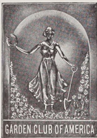
Awarded us twice by the Garden Club of America.

For finest results use SCHEEPERS' BULB FOOD (See page 34)