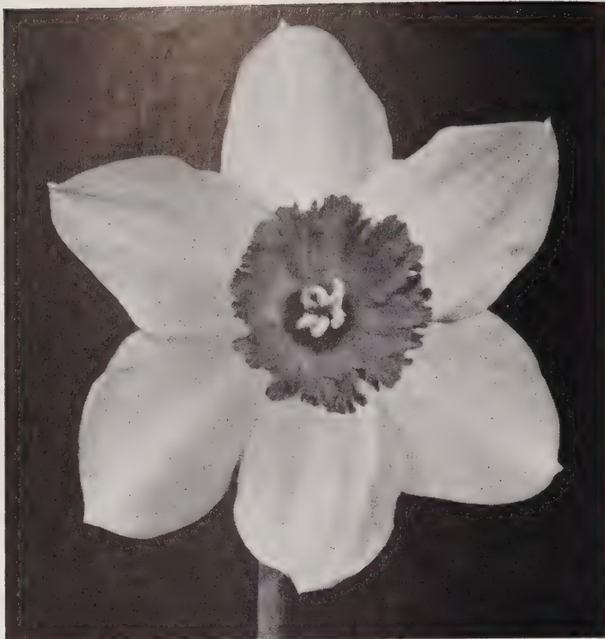
Incomparabilis Narcissus "DICK WELLBAND" (See page 19)

FIRETAIL. (3a) D deservedly popular the world over; broad-petaled creamy white perianth and large orange cup with scarlet-orange frill. First class Certificate. $1.65 for 10; $14.00 per 100.