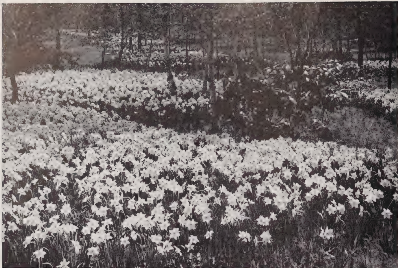
An exquisite planting of Naturalized Daffodils in the garden of one of our clients.