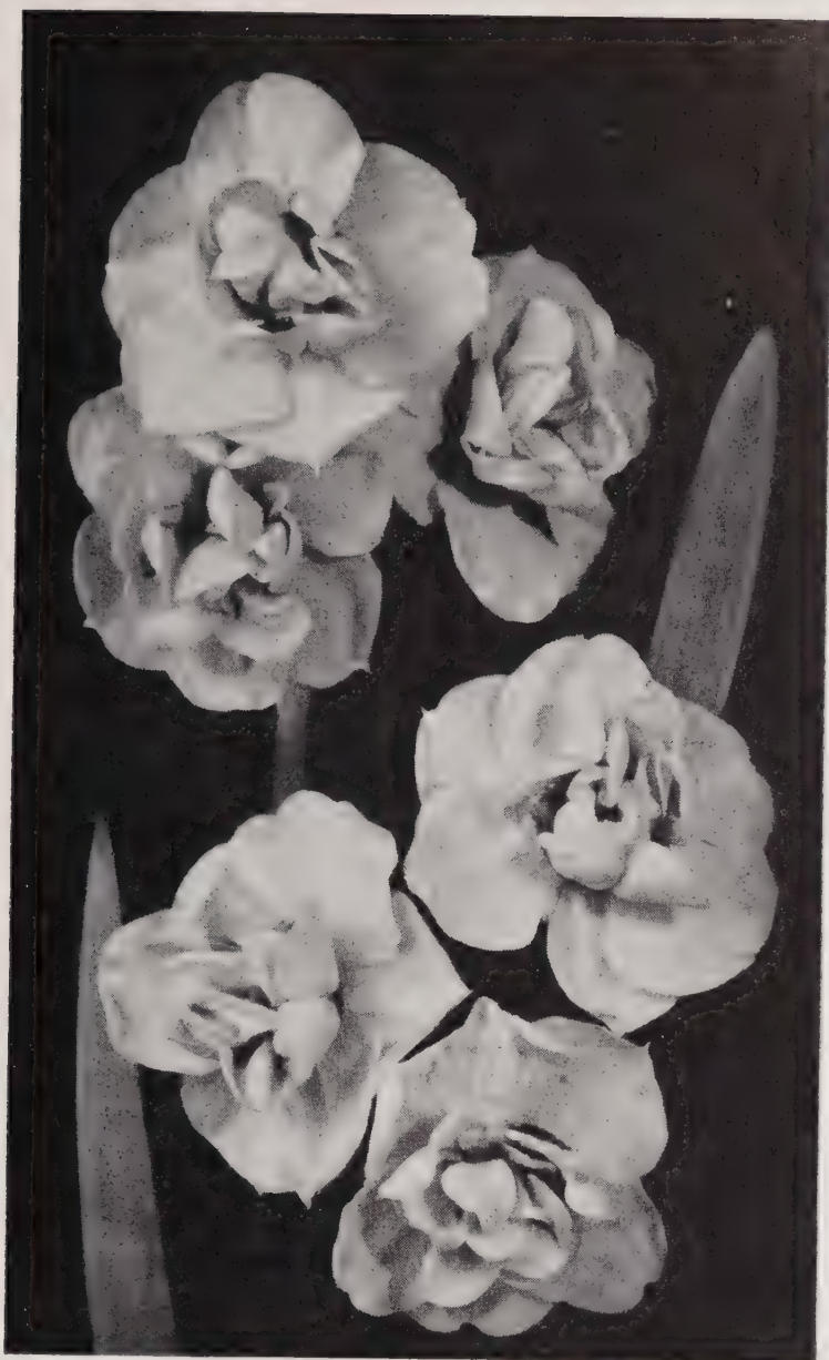
Double Poetaz, "CHEERFULNESS"