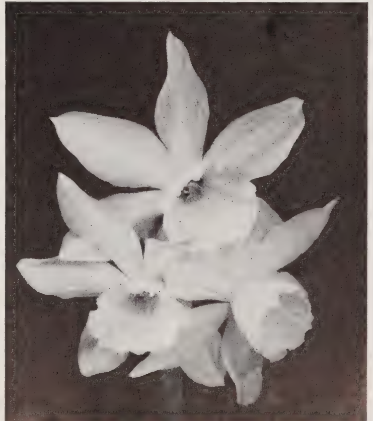
Triandrus Hybrid, "MOONSHINE"

TUNIS. (4a) A most beautiful, striking flower. Broad, white, overlapping perianth and wide-open, large cup of softest primrose becoming with age overlaid at the edges with a rare sheen of greenish gold. Outstanding exhibition variety and exceptionally fine for semi-shady situations in the garden. $2.25 for 10; $20.00 per 100. See illustration above.