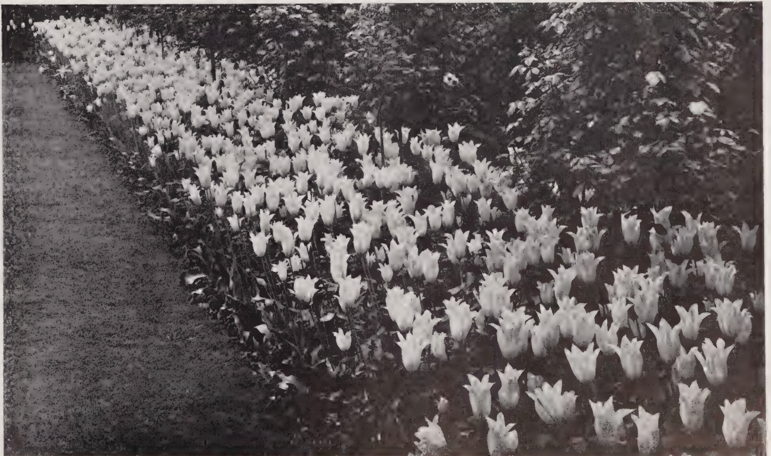
The Beautiful Lily Flowering Tulip "White Duchess" in a white and green garden (See page 12).

ZWANENBURG. A fine white Darwin Tulip, available at a reasonable price. Large flowers of good substance, of purest white with a small black base and black anthers. Tall and vigorous grower. Especially attractive combined with the deep red Darwin Tulip "Eclipse." Height, 32 inches. $1.50 for 10; $12.50 per 100. See illustration, Color Guide .