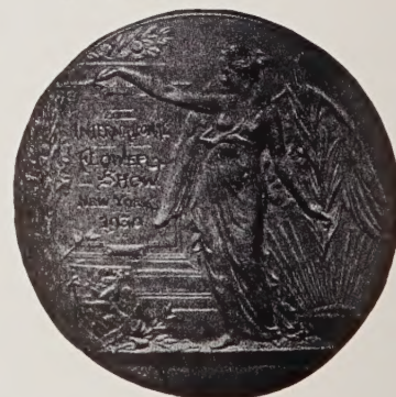
Awarded us many times at the International Flower Show, New York.