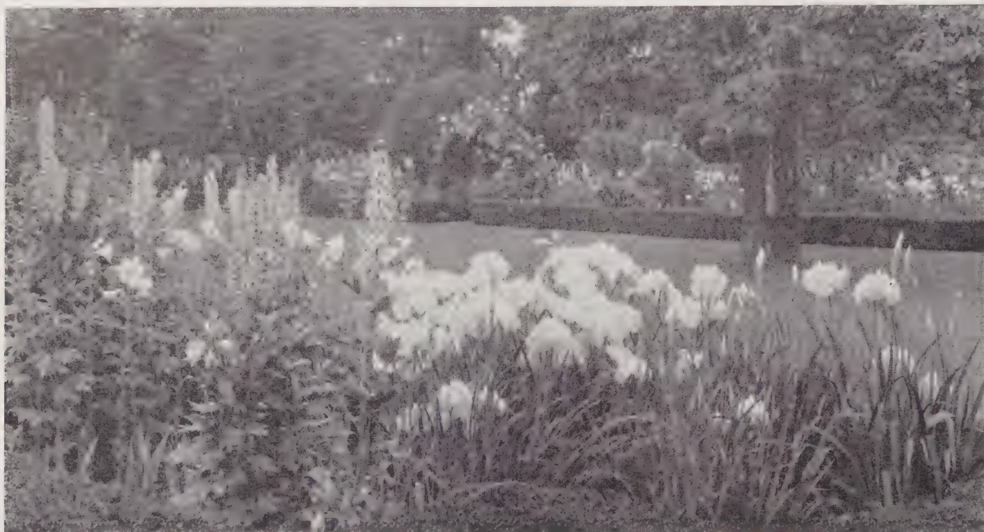
BETTIE F. HOLMES DELIGHTFULLY ARRANGED WITH BLUE DELPHINIUMS, REGALE AND MADONNA LILIES.

The best skill of the ingenious hybridists has been extended to bring this, their most splendid creation, to a high state of perfection. Today the great blossoms, which seem variously to be fashioned of delicate crepe, of lustrous satin, or rich velvet, exhibit an amazing range of hues, from gleaming white through tender grey to many tones of lavender and blue, and violet, from mauve through rose to claret to regal crimson-purple, many of them flushed or dappled, veined or margined with contrasting colors, creating an infinite variety of effects and beauty that has no peer. Truly "Orchids of the flower garden." They can be made happy and will grow in any garden.