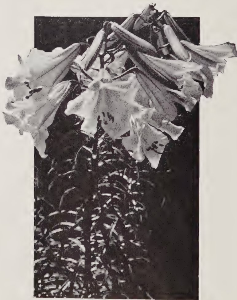
Lilium , GEORGE C. CREELMAN (See page 31)

WASHINGTONIANUM. A beautiful Lily with fragrant, drooping white flowers on a stem 4 to 5 feet in height. The reverse of the flowers has a tinge ranging from light pink to a deep wine color. This Lily requires a thoroughly drained situation; it does exceedingly well when once established. Stem-rooting; June-July flowering; plant in fall only, 10 inches deep. Extra selected bulbs, $1.50 each; $12.50 for 10; $110.00 per 100.