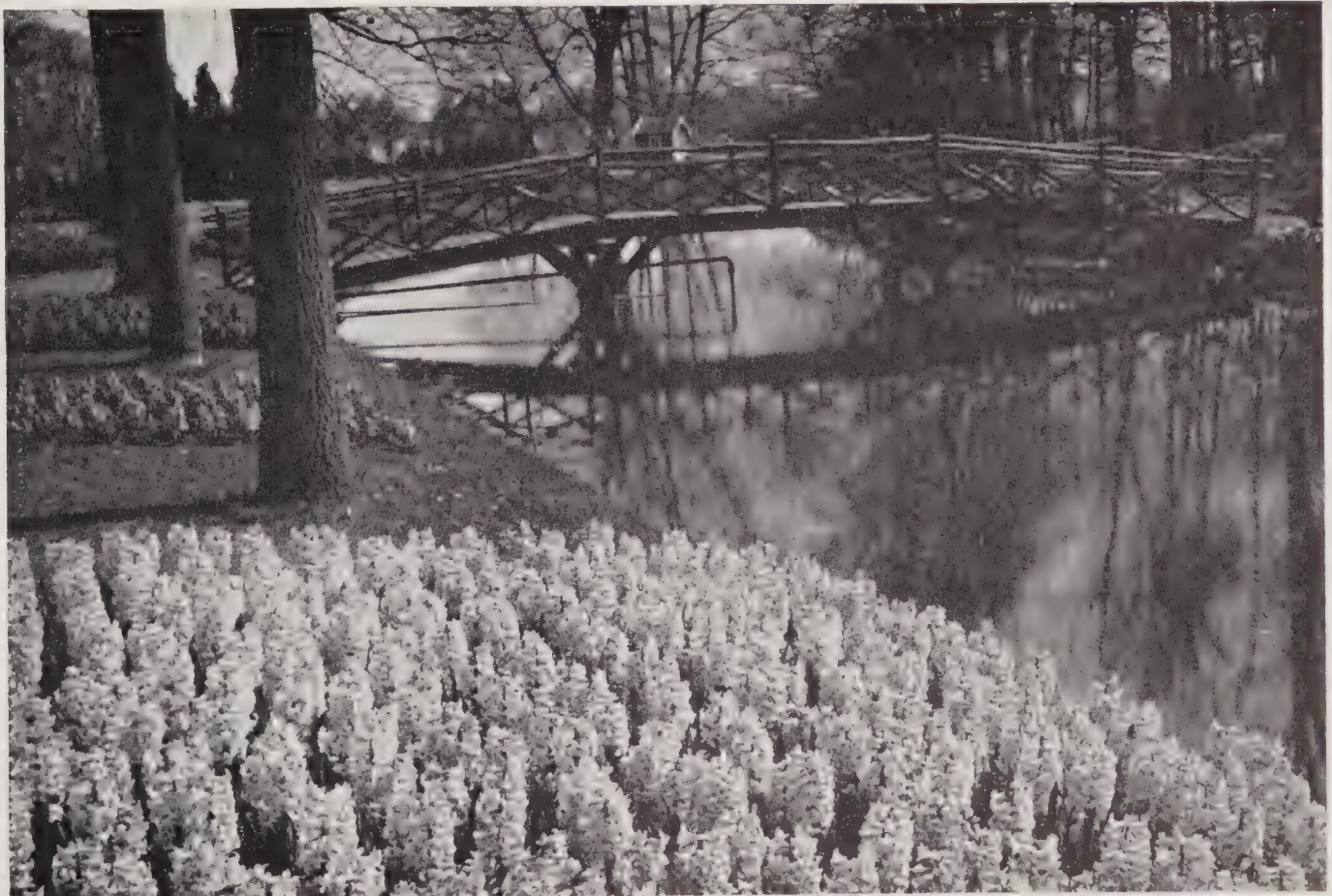
An Excellent Use for the Holland Hyacinths

CITY OF HAARLEM. Strong, large truss of bright golden yellow. $2.45 for 10; $22.00 per 100.