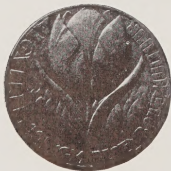
Awarded us for our exhibit in the International Spring Flower Show at Heemstede, Holland.