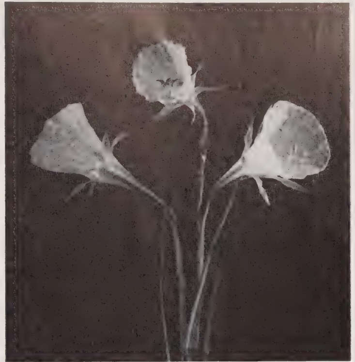
Narcissus, "BULBOCODIUM CONSPICUUS"

W. P. MILNER. A miniature with white trumpet and perianth. Splendid for planting in the rock garden or for small pans. Extra heavy bulbs. $1.50 for 10; $12.50 per 100.