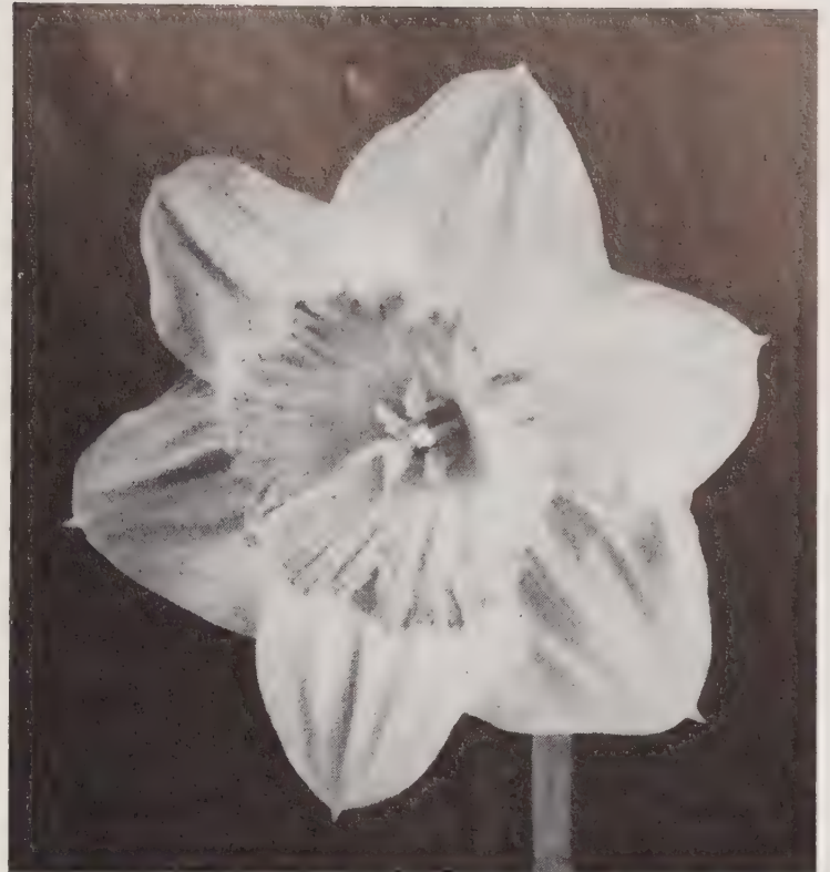
Leedsii Narcissus, "TUNIS"

THALIA. (5b) Often called the Orchid-flowered Daffodil. The beautiful pure white flowers are carried three or four to a stem and are most attractive for either indoor decoration or planting in the rock garden. Very attractive. $2.50 for 10; $22.50 per 100.