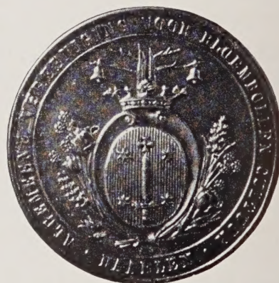
Awarded us three times by the Holland Bulb Growers' Association of Haarlem, Holland.