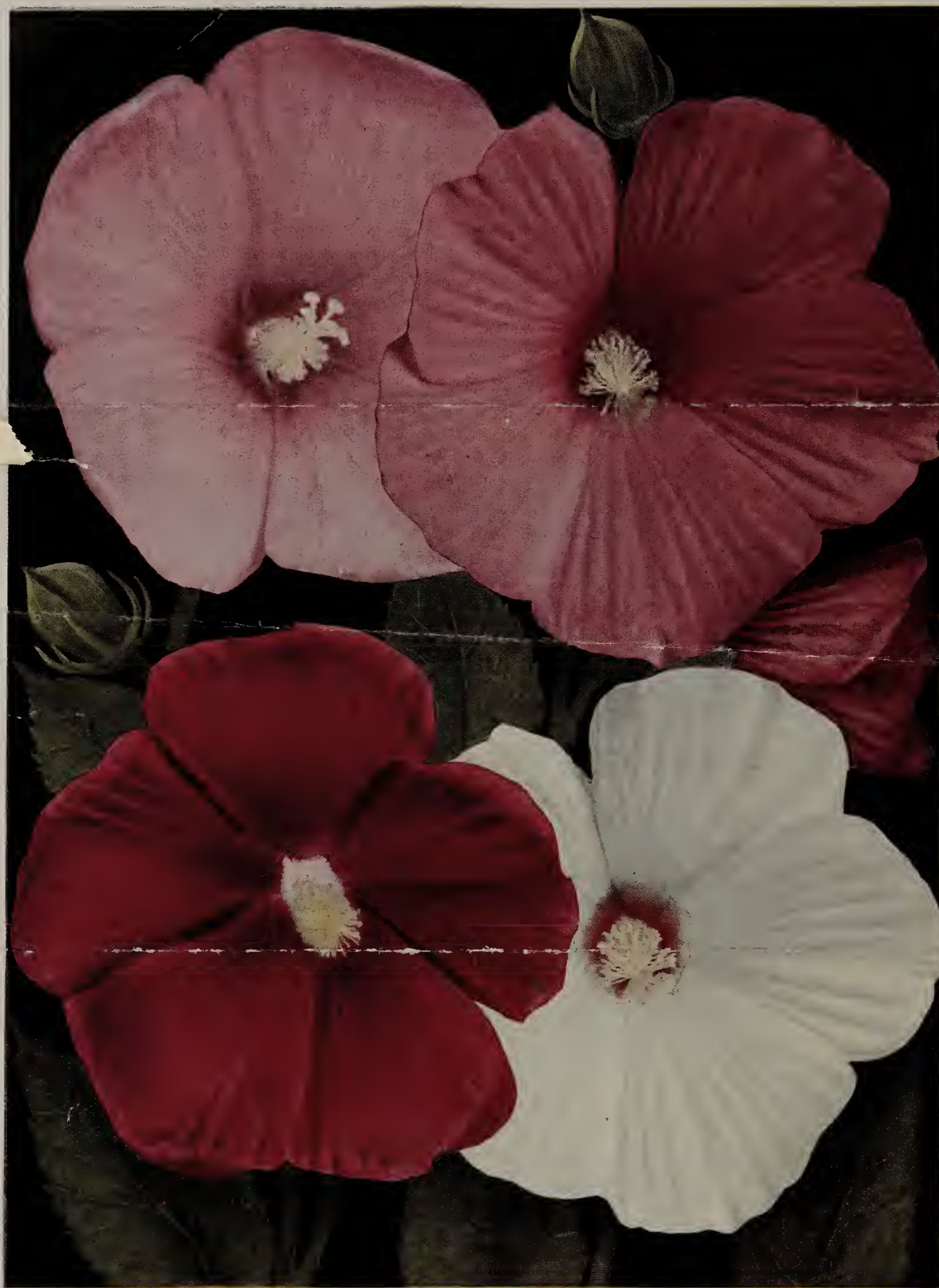
Natural size 8 to 10 inches