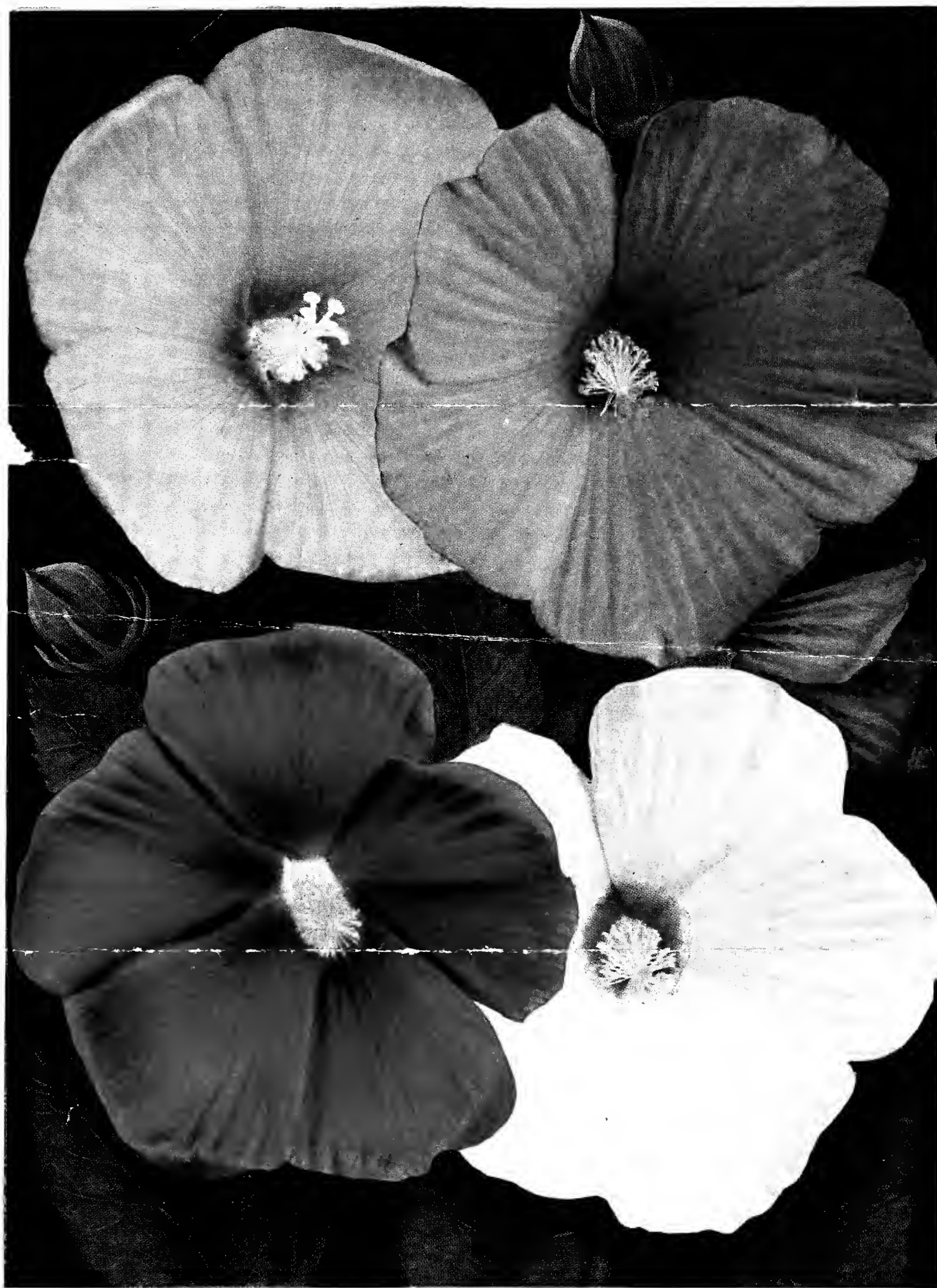
Natural size 8 to 10 inches