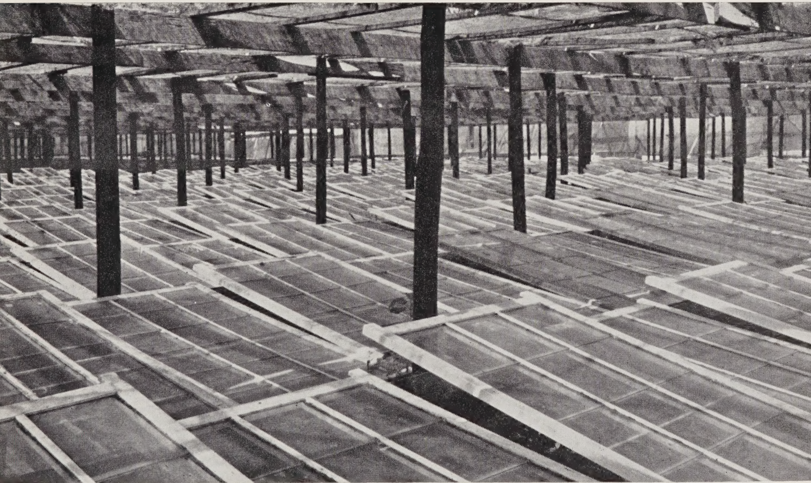
Hot beds where we grow Azalea liners. These beds are equipped with a hot water heating system for protection.

For nurserymen and growers we are offering this year a million and a half Azalea liners. We keep them growing all winter in our heated frames in specially prepared soil. They are well rooted and branched for spring delivery. We usually start shipping these liners about the last week in March, but for greenhouse operators where space is available it is better to get them in early February. Because of the quality of our plants and the very low price at which we are offering them, we are usually booked up early in the season. We urge you to order early.