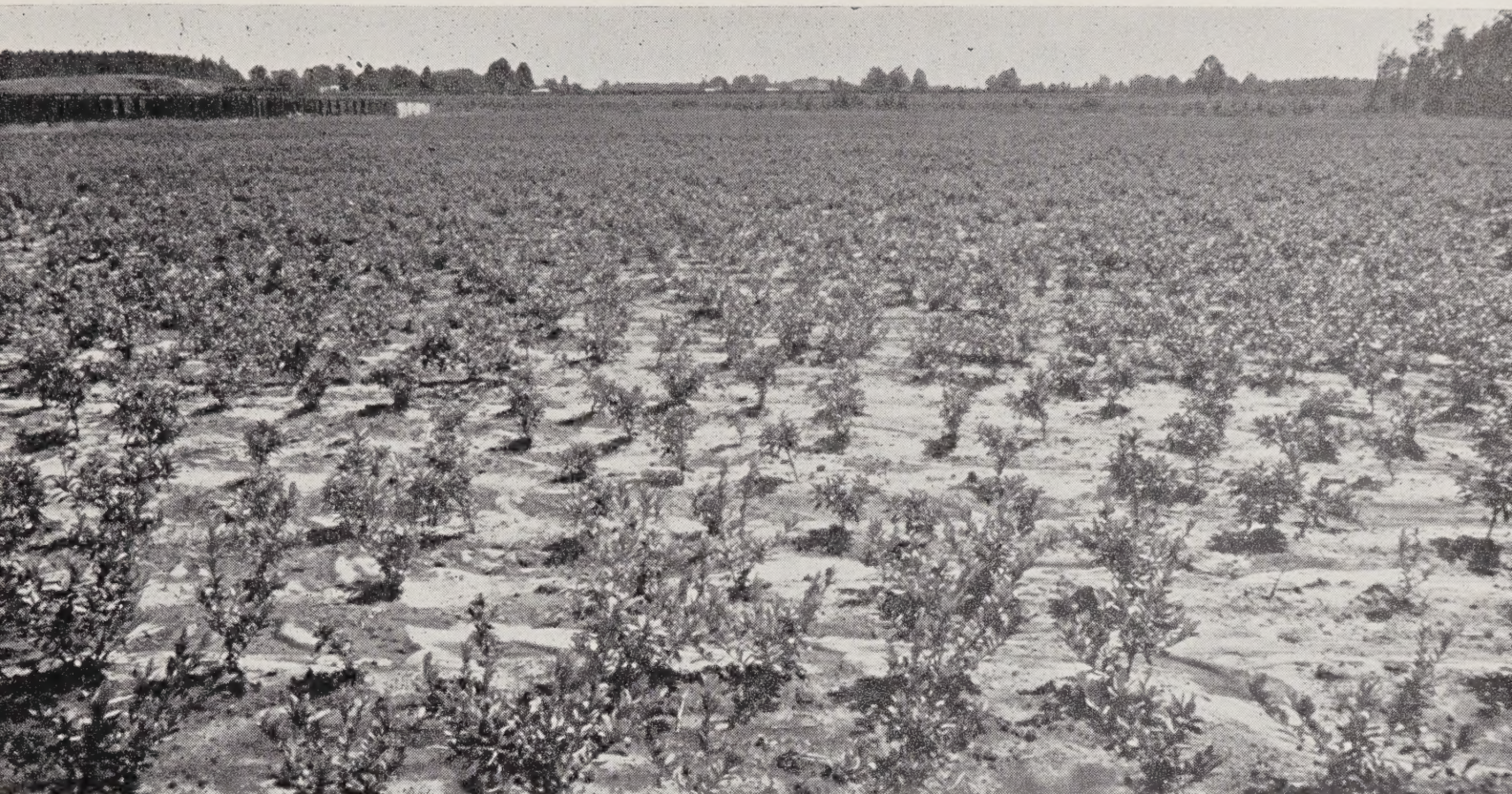
A block of Indica Azaleas in open field.