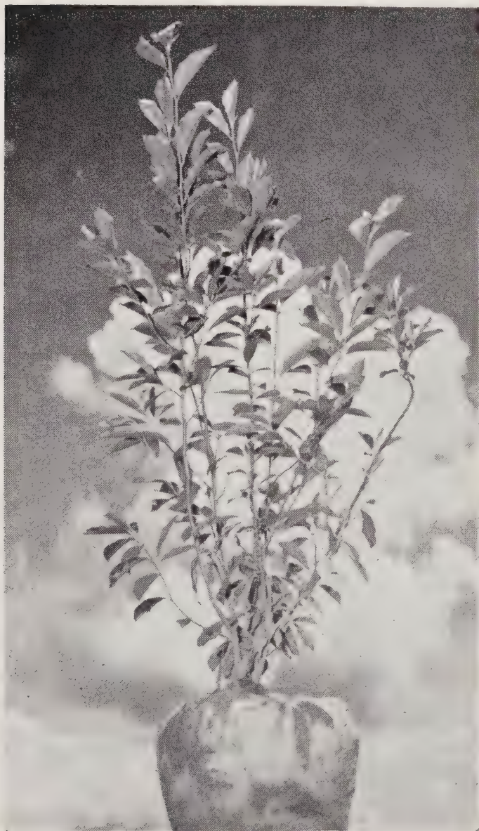
MAGNOLIA SOULANGEANA 3 to 4 ft. B&B