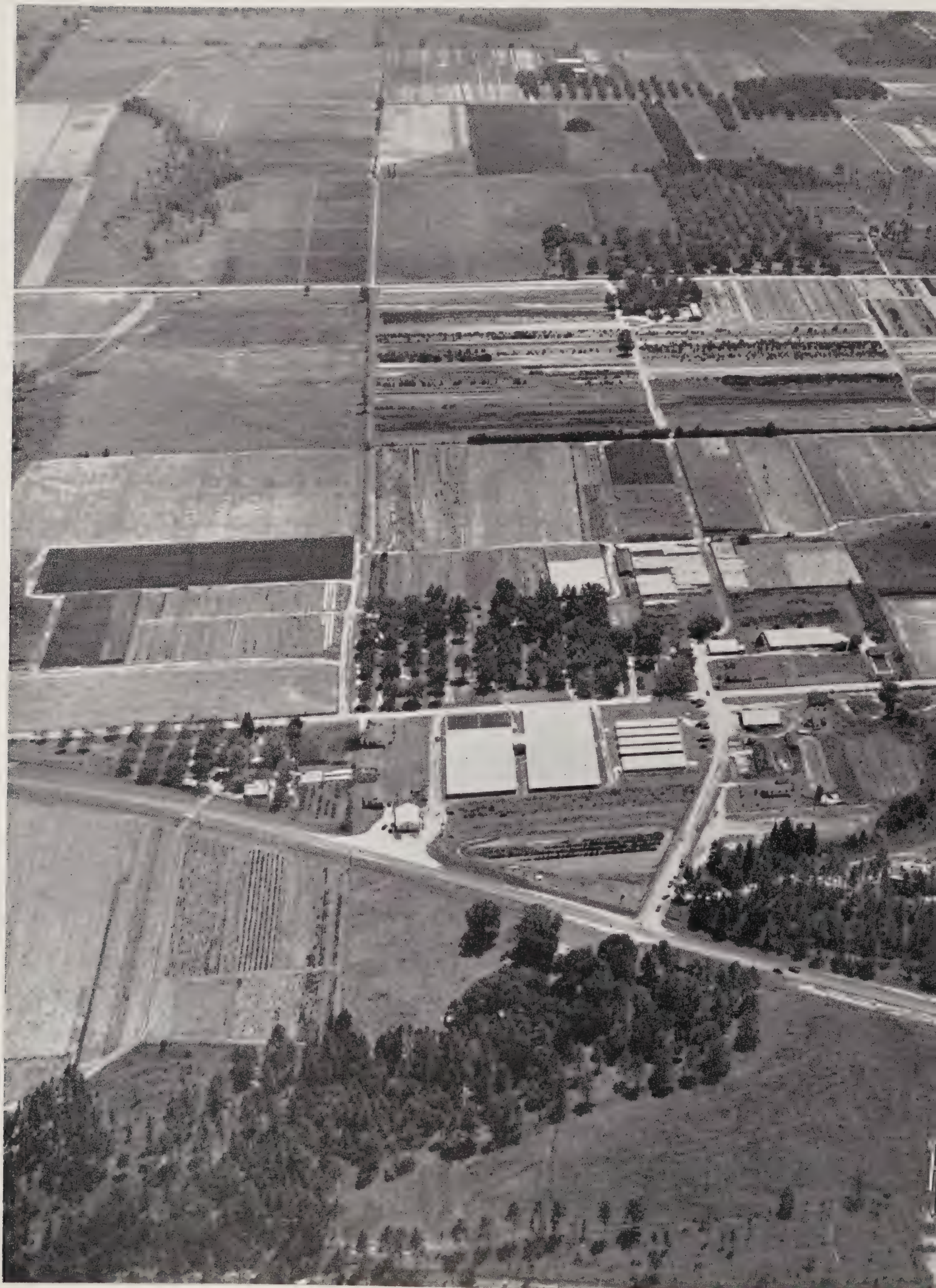
An aerial view of