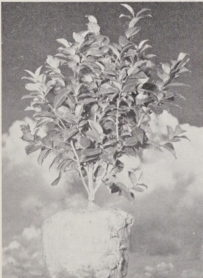
18 to 24 inch Specimen Camellia, B&B

Pink Perfection (Frau Minna Seidel). Very popular shell-pink that is early and blooms very freely.