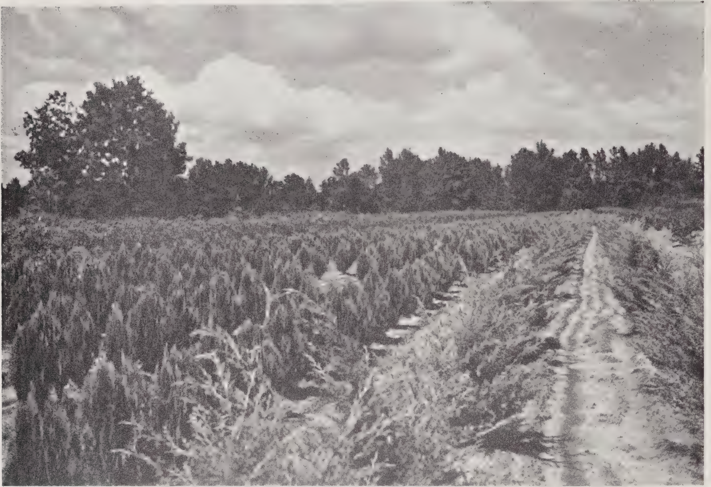
A field of Evergreens. We can supply a few items for truck and carload shipment of these.

Buxus Harlandi. Slower in growth than B. Japonica, and hardier. Dark green leaves. Grows thick and rounded with little trimming.