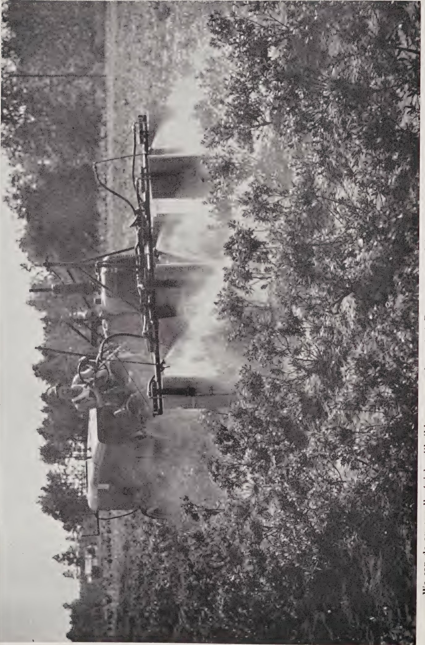
We can do an excellent job with this spray equipment. A Bean pump and tank with rigging made in our own shops.

20% "CASH AND CARRY" Discount Allowed on All B&B Stock.