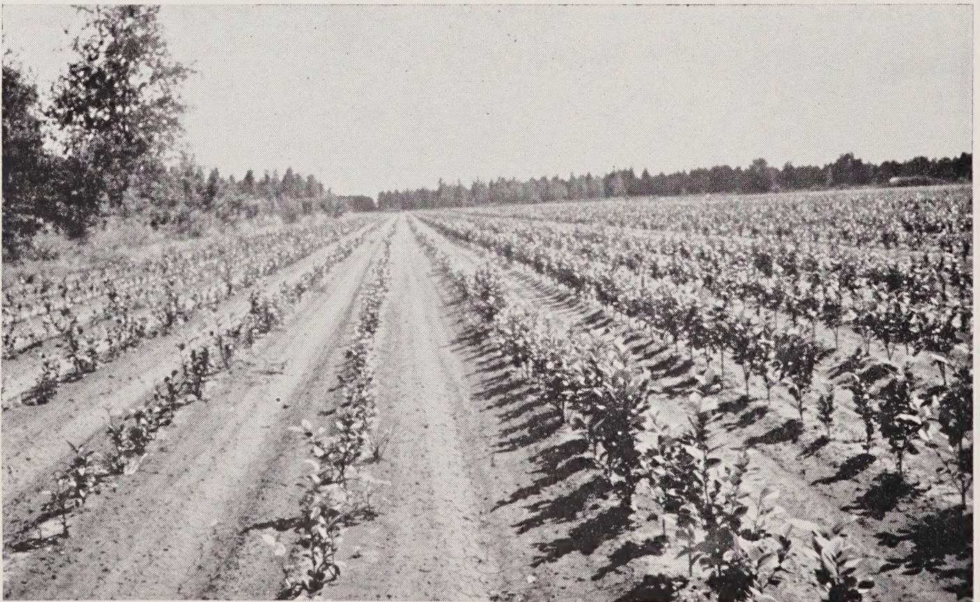
Block 2-year field grown Camellias

20% "CASH AND CARRY" Discount Allowed on All B&B Stock.