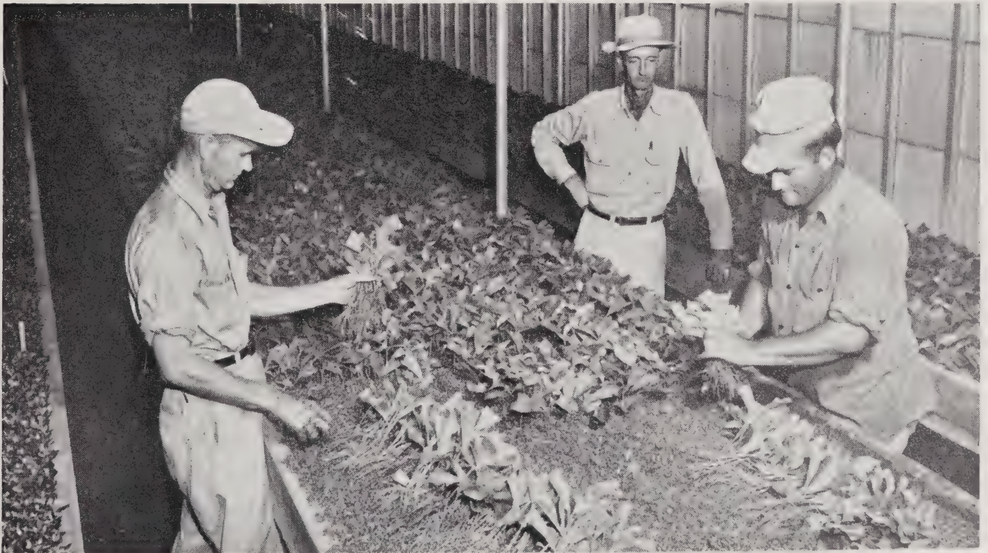
Inside one of our propagating houses. Note the heavy roots on the Magnolia cuttings.