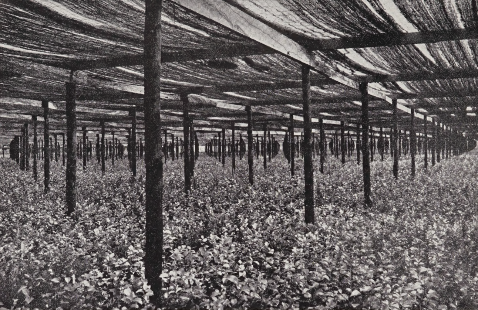
Lath house scene showing thousands of our Camellia liners.