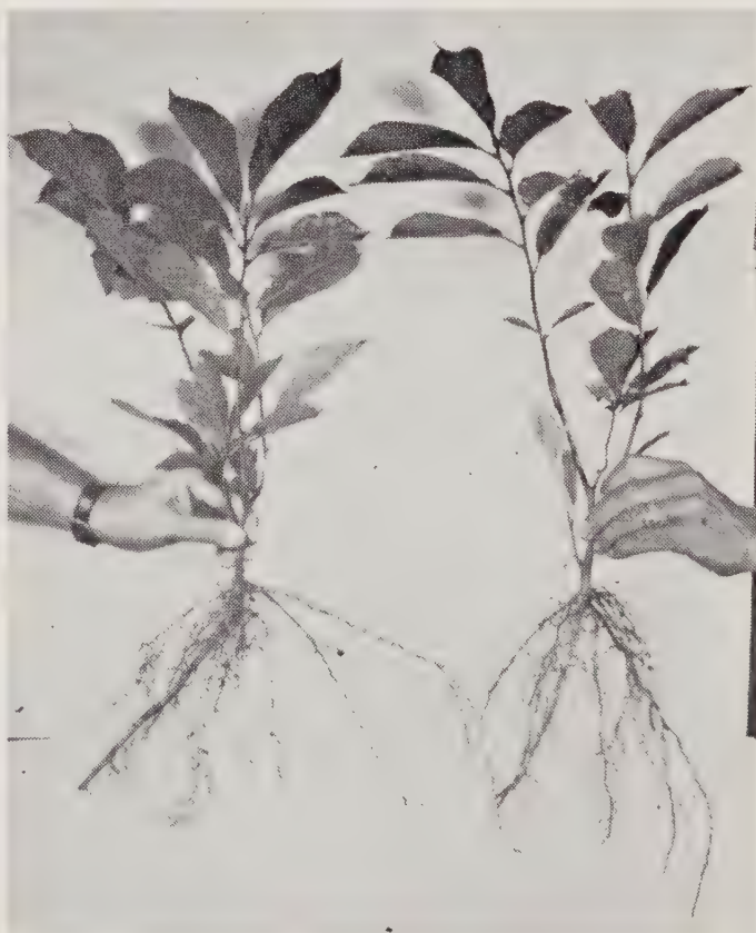
MAGNOLIA SOULANGEANA 12 to 18 in. liner