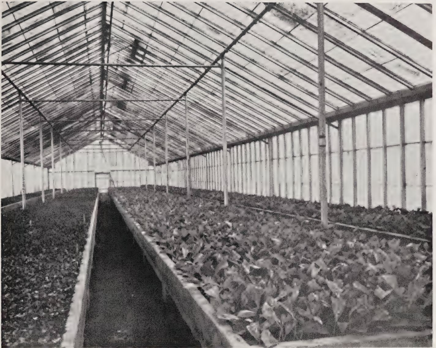
Inside one of our propagating houses—Magnolia Cuttings.