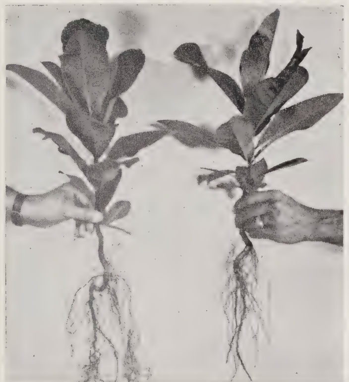
MAGNOLIA GRANDIFLORA 8 to 12 in. liner

20% "CASH AND CARRY" Discount Allowed on All B&B Stock.