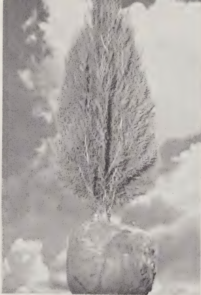
THUYA O BAKERI 3 to 4 ft., B&B