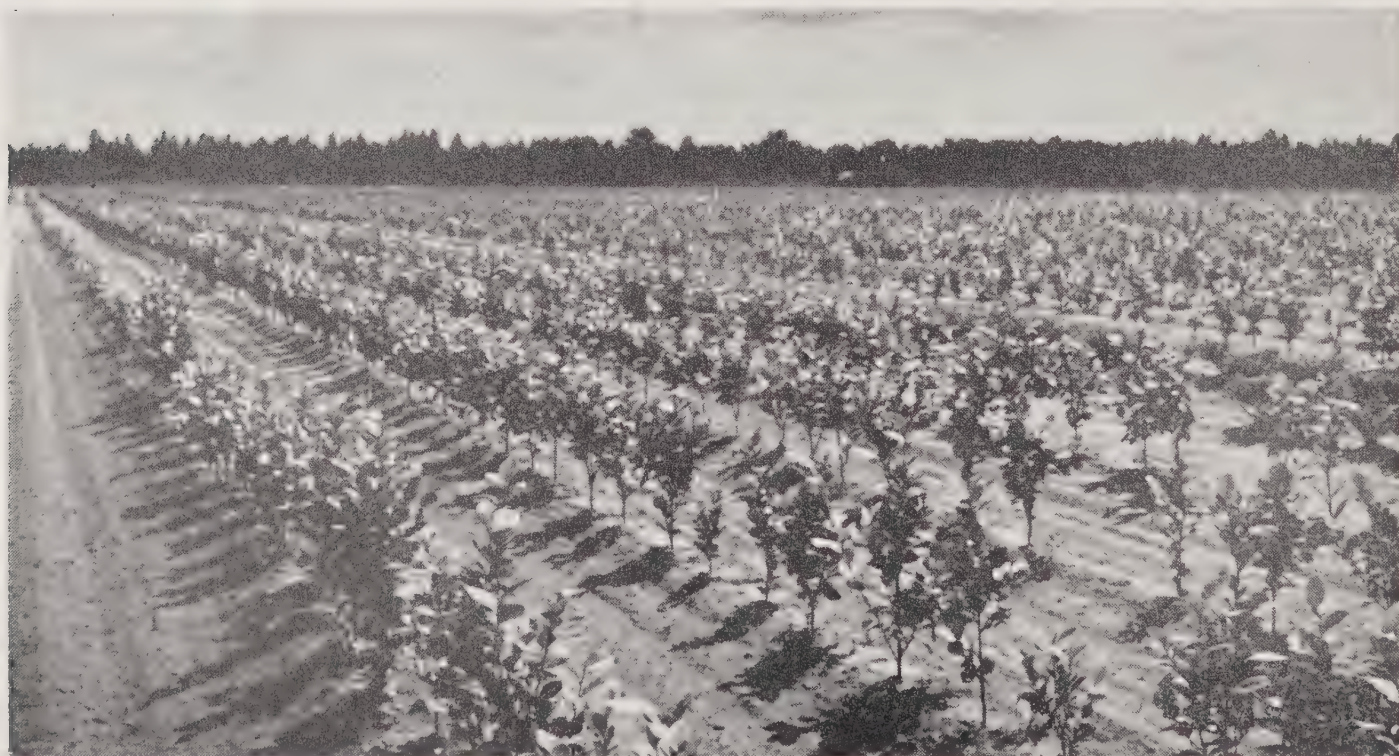
A field of 18-24 inch branched Camellias.