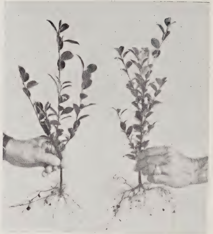
CAMELLIA SASANQUA 8 to 12 in. liner