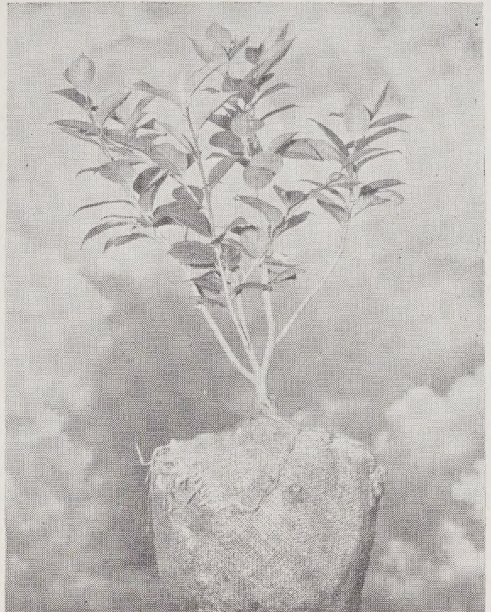
18 to 24 in. Branched B&B

Monarch. Very large, deep pink with white variegation. The stamens are so intermixed that often one single flower will resemble a bouquet. Very compact; dark green foliage.