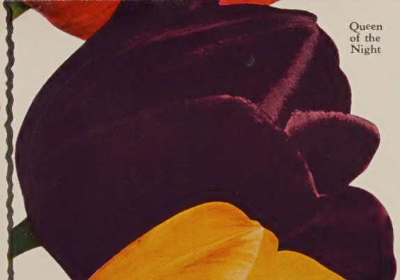
Queen of the Night