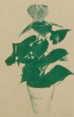
PHILODENDRON S. HAHNII