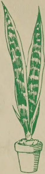
S. LAURENTI (2 LEAVES)