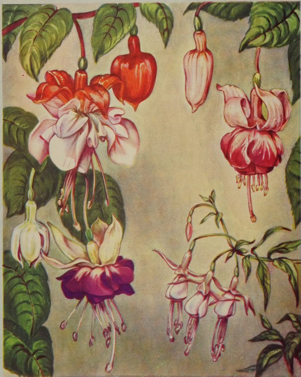
SWINGTIME SEA FOAM