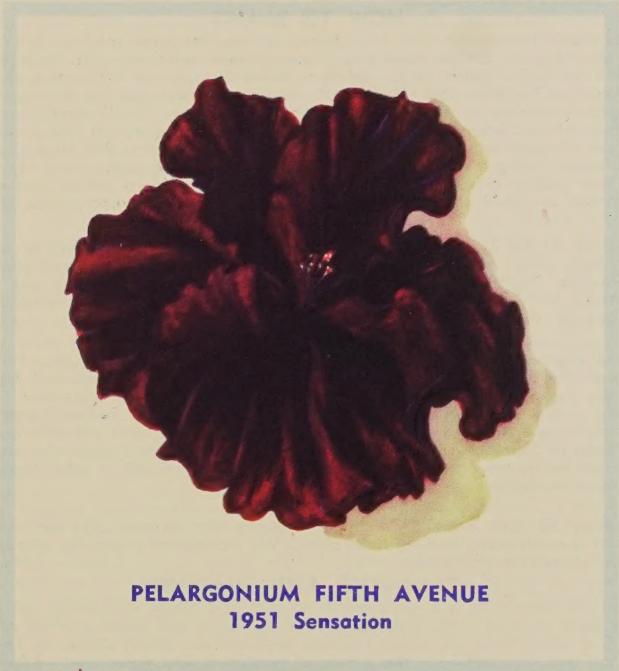
PELARGONIUM FIFTH AVENUE 1951 Sensation