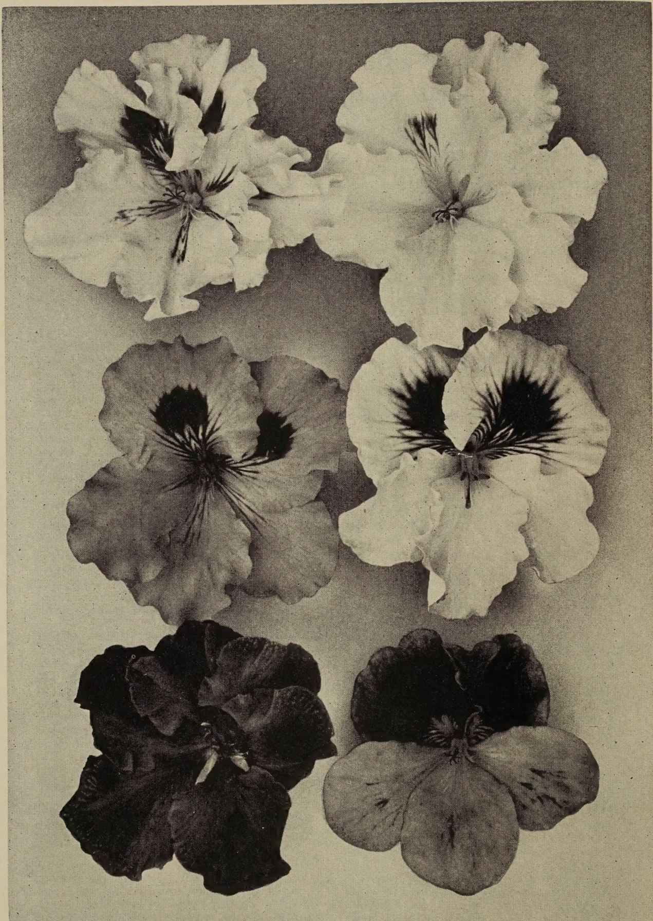
VALENTINE GIRL GRAND SLAM BLACK PRINCE