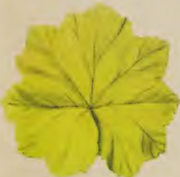
DWARF GOLD LEAF