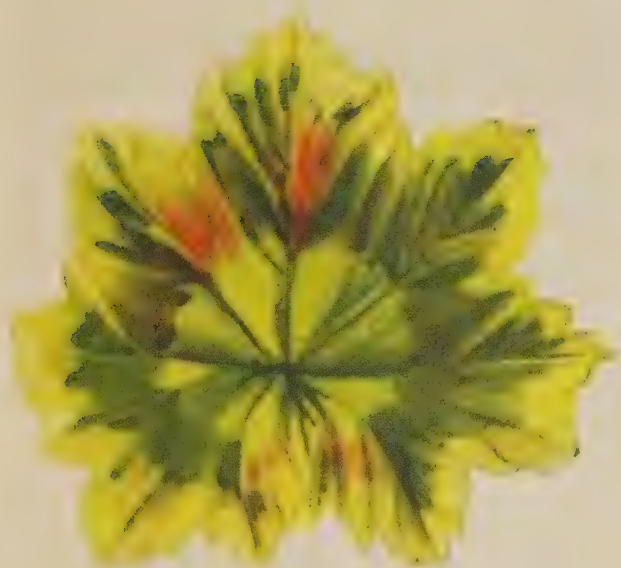
SKIES OF ITALY