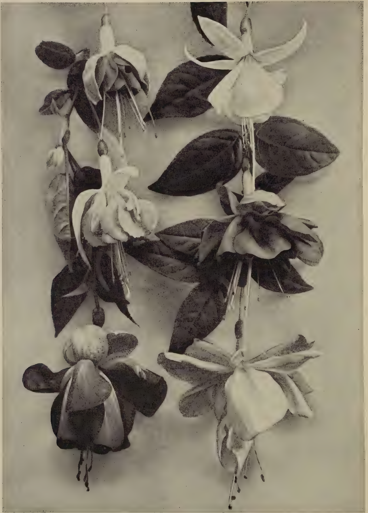
BLUE PENDANT FLIRTATION SAN MATEO