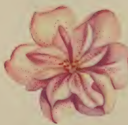
BIRD'S EGG PINK