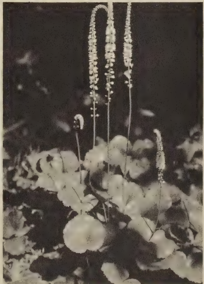
(At Right) Galax Aphylla Listed on Page 17