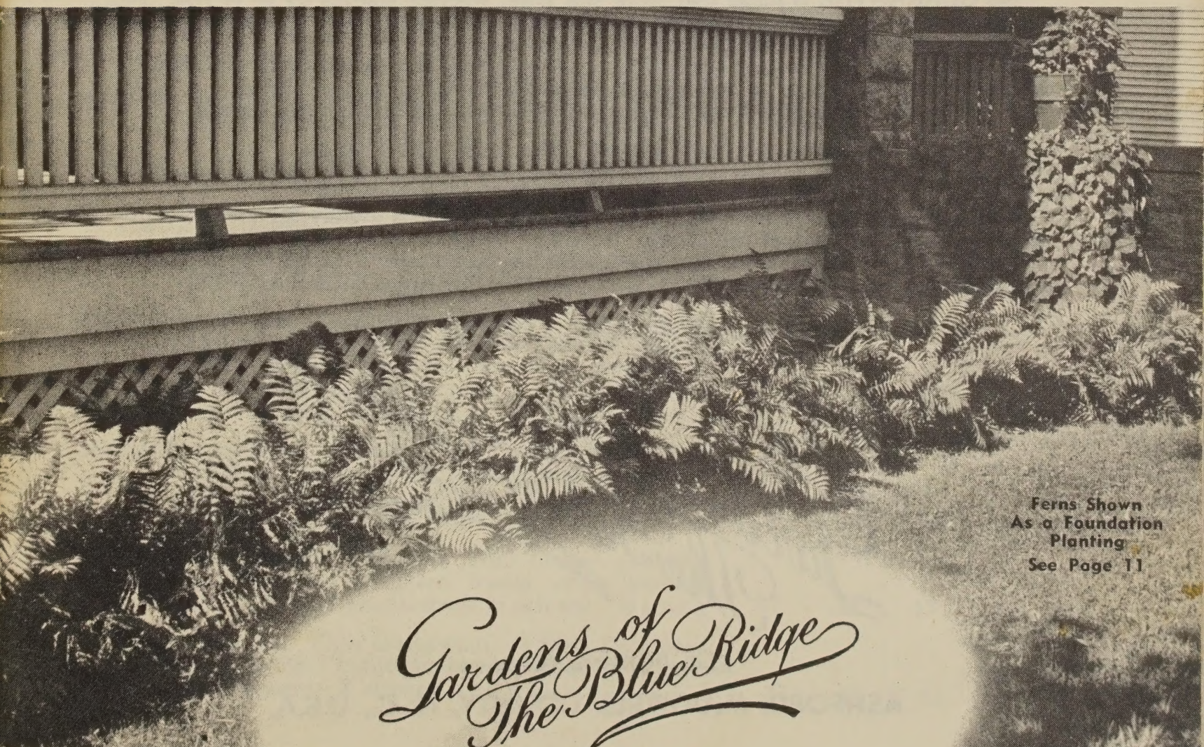
Ferns Shown As a Foundation Planting See Page 11