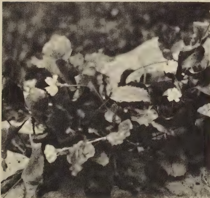
(Above) Shortia Galacifolio. Oconee-Bells