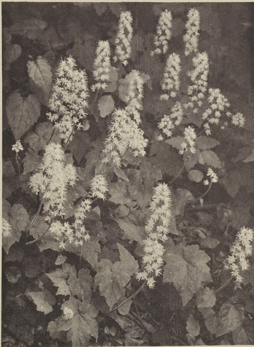
Tiarella Cordifolia Listed on Page 4