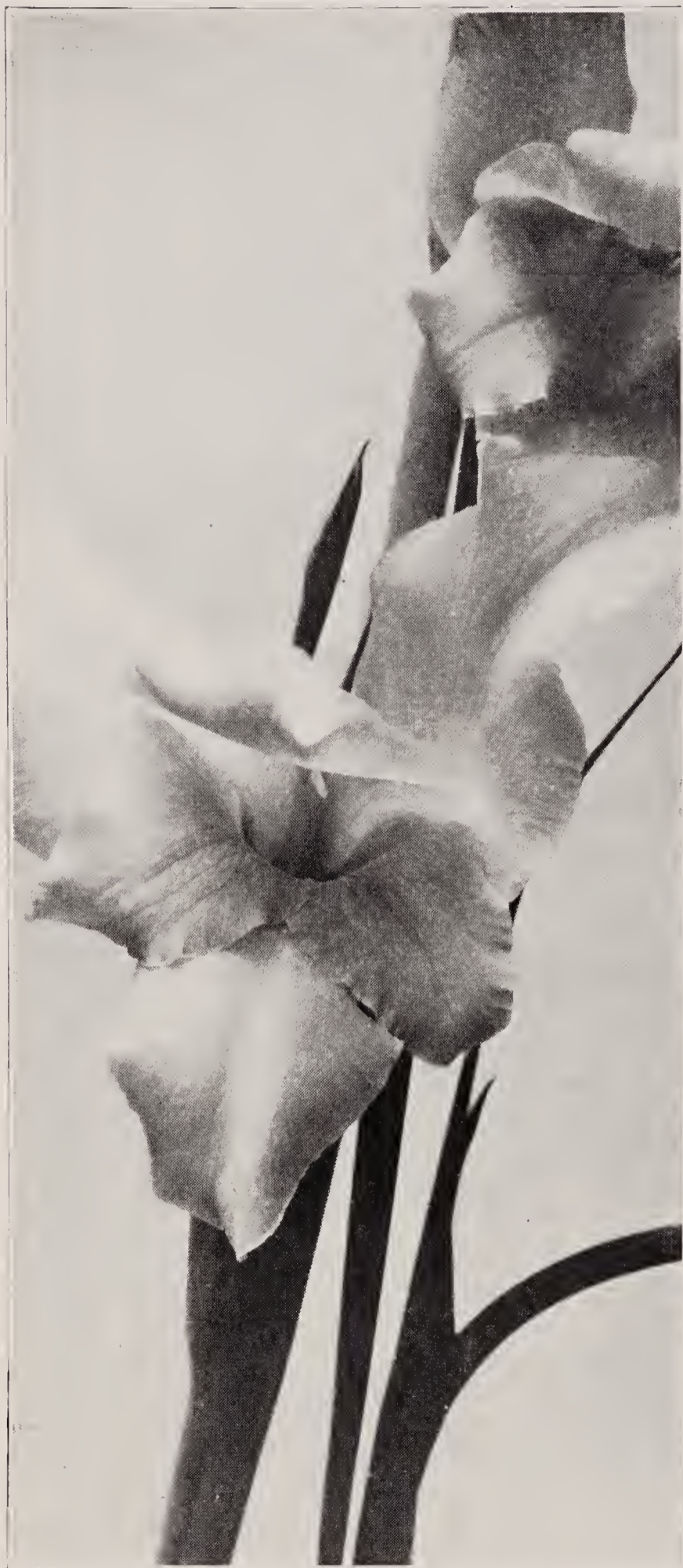
CLOSE UP OF LADY DAINTY