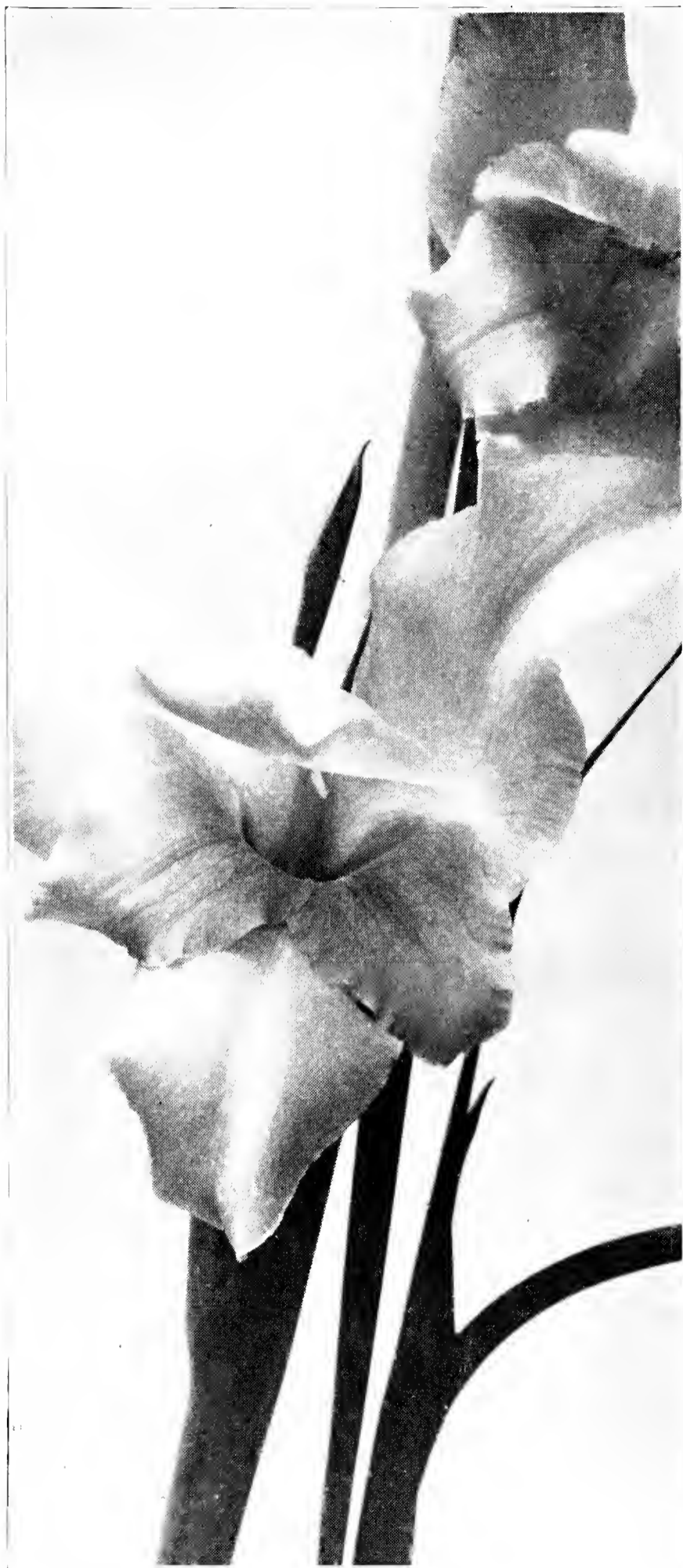
CLOSE UP OF LADY DAINTY