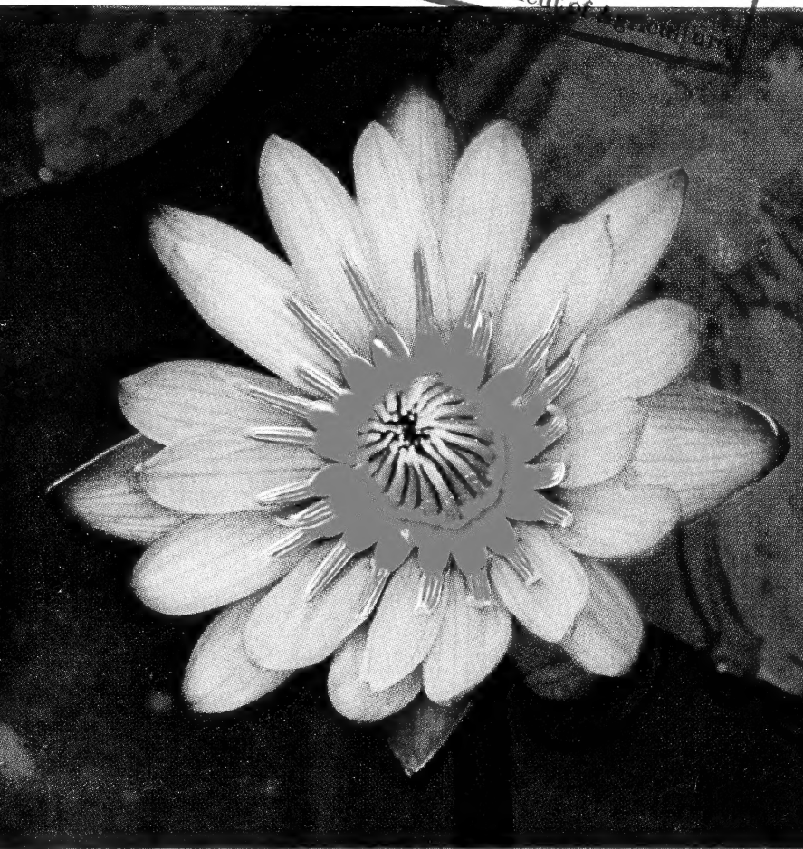
Zanzibariensis Rosa $2.00 Each