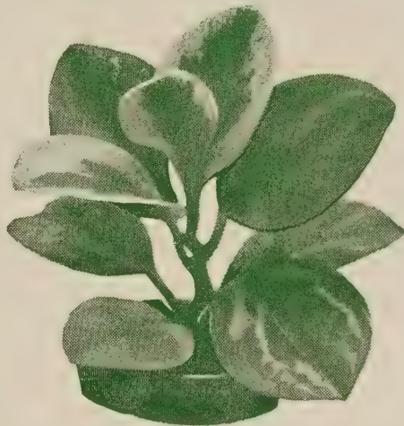
PEPEROMIA OBTUSIFOLIA VARIEGATA

Peperomia Obtusifolia — A begonia-like heavy, waxy, leaved plant about 6 to 12 inches tall. Attractive dark green house plant of easy culture. Small Plants 35¢, Medium 75¢, Large $1.00.