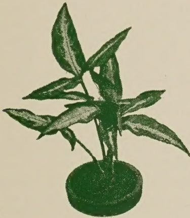
NEPHTHYTIS LIBERICA VARIEGATA

Nephtytis Liberica. Dark green lanceolated leaves. Will grow well in either water or soil. Faster grower when given support to climb. Small Plants 35¢, Medium Plants 75¢.