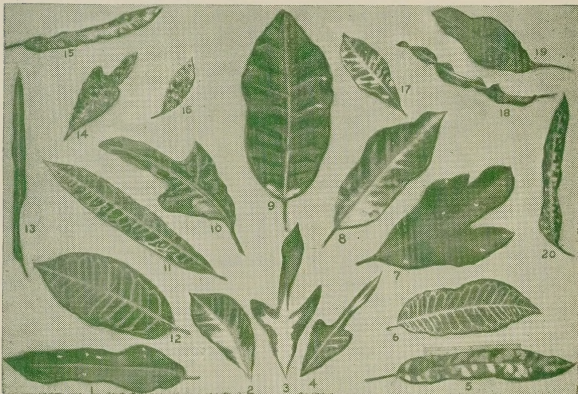
A Collection of Croton Leaves. For Description See Below.

Codiaeum Variegatum—CROTON. Probably the most colorful foliage Tropical Plant. In no other group of plants will you find such a variation of colors and leaf forms. Each plant will have several different color variations in a single leaf with no two leaves having exactly the same variegation. The range of color is greater in the new rare highly colored varieties. All new Croton foliage is usually green or yellow depending on variety, coloring up as the plant Matures. All Crotons should have direct sunlight to bring out the most vivid colors and should be kept out of cold drafts. In the picture above we have shown some of the Rare Varieties as well as some of the old favorite Standard Varieties.