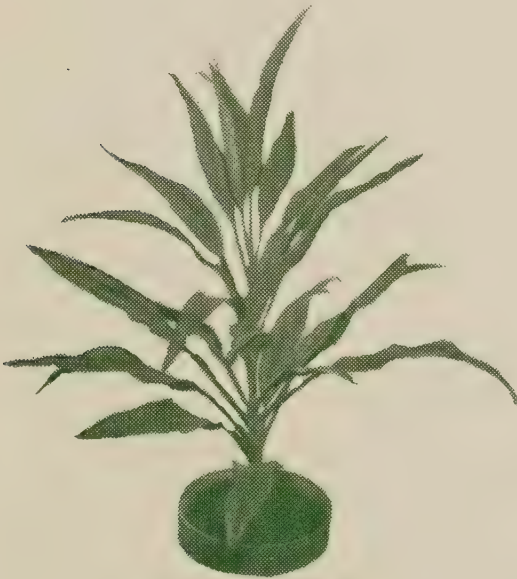
DRACAENA EUGENE ANDRE

Dracaena Godseffiana. Different from all other Dracaenas. Free branching and suckering habit; has rich dark green leaves densely marked with creamy white spots. Good Dish Garden subject. Small Plants 75¢, Large $1.50.