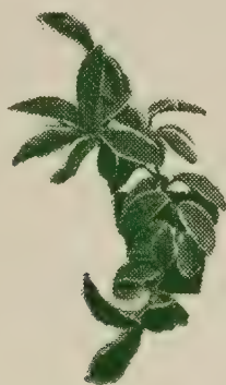
HOYA CARNOSA VARIEGATA

Hoya Carnosa Variegata—VARIEGATED WAX PLANT. Leaves a rich dark green edged with white, new leaves tinted with shades of pink changing to green and white as they mature, a real beauty. Its waxy, fleshy foliage makes a good variegated foliage plant. Rapid grower during the spring and summer months. Should be given a little fertilizer and increased watering in spring to encourage new growth (this is true of all Hoyas). Keep on the dry side during winter months. Small Plants 75¢.