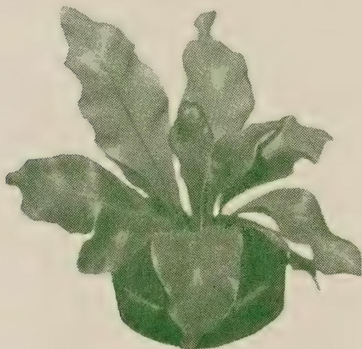
ASPENIUM NIDUS AVIS

Alsophila Australis — AUSTRALIAN TREE FERN. The most handsome of all tree ferns, with thick hairy stems and graceful fronds. The fronds of this fern reach enormous size in mature plants. An ideal house fern. Small Plants $3.50, Specimen Plants $5.00 to $10.00.