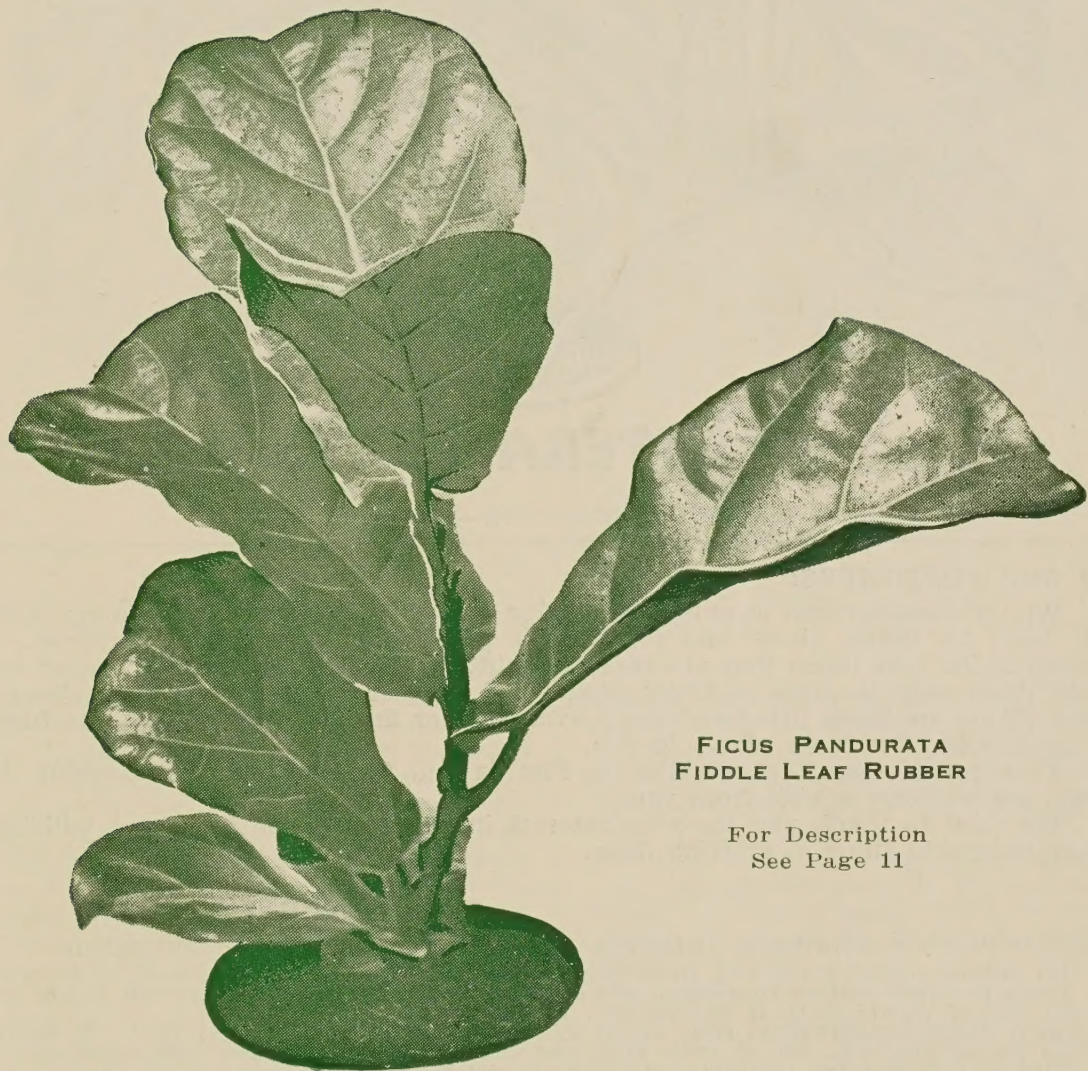
FICUS PANDURATA FIDDLE LEAF RUBBER