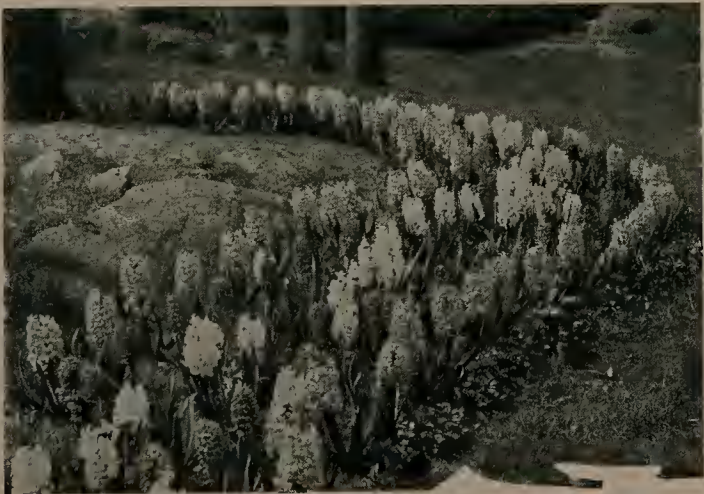
Extra-selected Exhibition Hyacinths