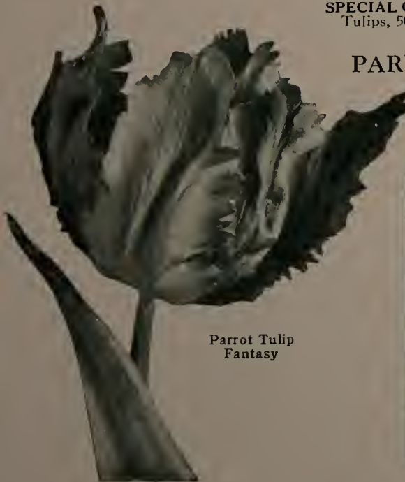
Parrot Tulip Fantasy