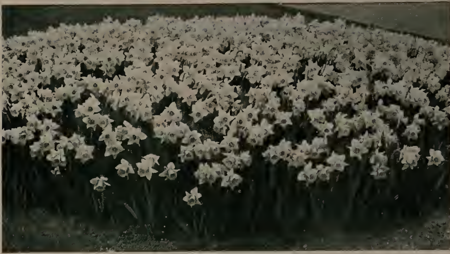
Bed of Large-trumpet Narcissus

Polygonum (Silver Lace Vine). Foamy white. 35c. ea.