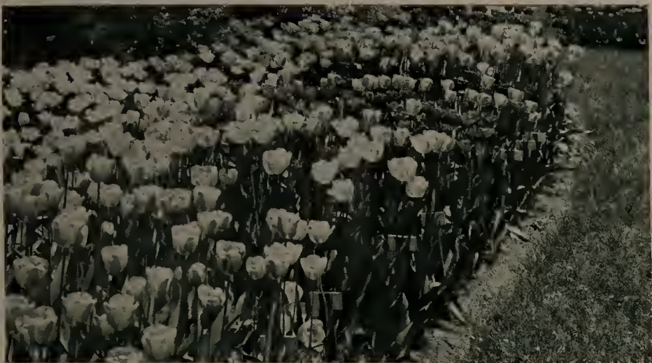
Planting of Darwin Tulips