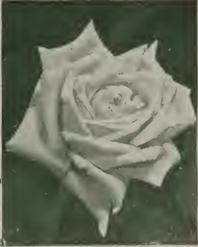
Mme. Jules Gravereaux