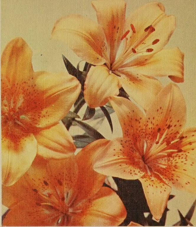
GOLDEN CHALICE HYBRIDS. Selected golden-yellow forms of the Rainbow Hybrids, these superb, sturdy, vigorous garden lilies are ideal for the perennial border. June-flowering, enormous substance and glowing with health, rich green foliage, grand garden plants. Plant five to six inches deep, they increase rapidly. each, $0.90; three for $2.50; per dozen, $9.00