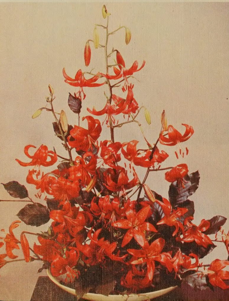
FIESTA HYBRIDS. Gay, sparkling, recurved Turk's-cap bells of richest red, maroon, golden yellow and orange, borne on thin wiry stems from four to five feet tall. Sun-loving, plant five inches deep, they increase rapidly from underground bulblets. Award of Merit, Boston. each, $0.75; three for $2.00; per dozen, $7.50