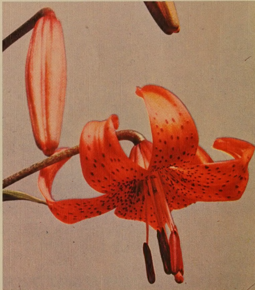
TALISMAN. A completely new and different Tiger Lily , vigorous, prolific with innumerable bulbils growing along the stem; flowers in early July, a month before the Tiger lily. Perfect for the border, for the open woodland, for cutting; stands from five to six feet tall with many large nodding flowers, a "must" for every lily garden. each, $0.75; three for $2.00; per dozen, $7.50