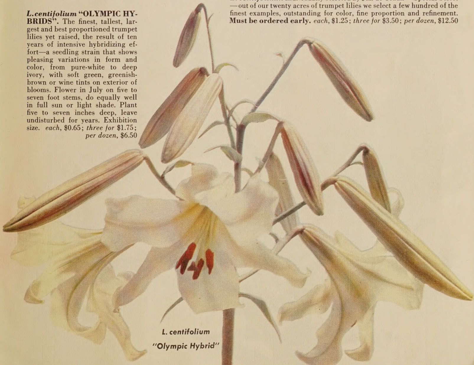
L. centifolium "Olympic Hybrid"

L. centifolium "OLYMPIC HYBRIDS" . The finest, tallest, largest and best proportioned trumpet lilies yet raised, the result of ten years of intensive hybridizing effort—a seedling strain that shows pleasing variations in form and color, from pure-white to deep ivory, with soft green, greenish-brown or wine tints on exterior of blooms. Flower in July on five to seven foot stems, do equally well in full sun or light shade. Plant five to seven inches deep, leave undisturbed for years. Exhibition size. each, $0.65; three for $1.75; per dozen, $6.50