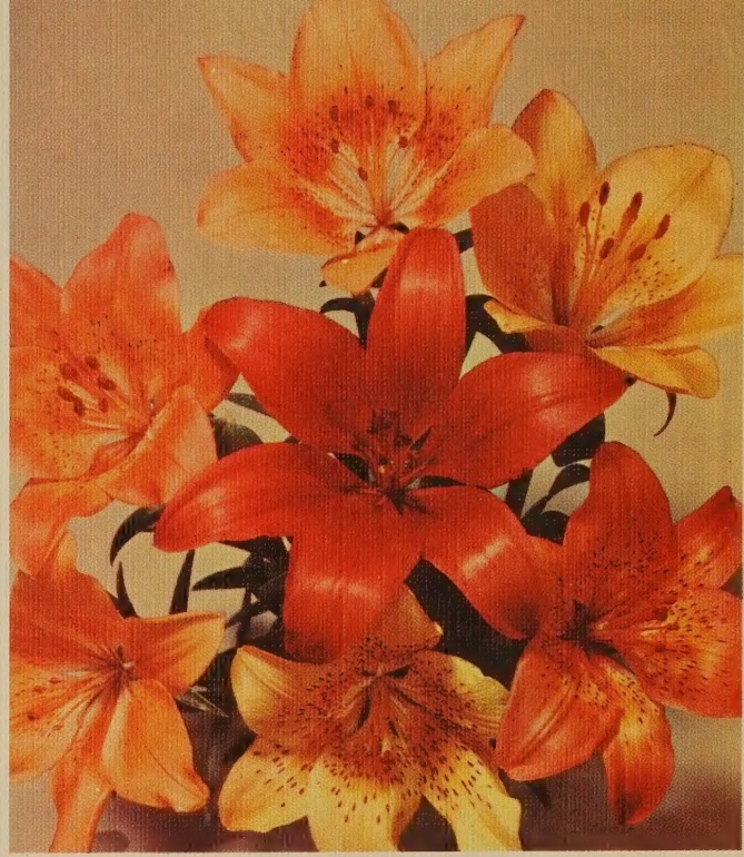
RAINBOW HYBRIDS. A new race of upright-flowering lilies in shades of yellow, orange and red; gay as a field of tulips, they flower profusely during early June, stems eighteen inches or more; very hardy and easy to grow, plant five to six inches deep in well-drained soil, full sun or part shade. each, $0.75; three for $1.75; per dozen, $7.50