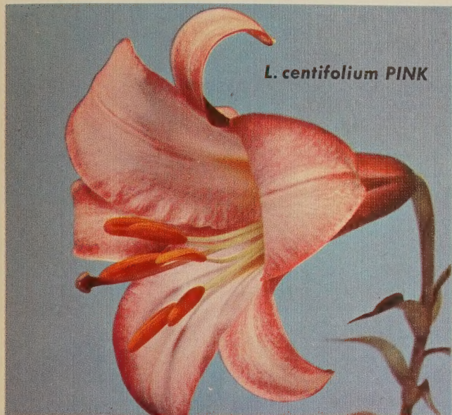
L. centifolium PINK

each, $4.00; three for $11.00; per dozen, $42.00