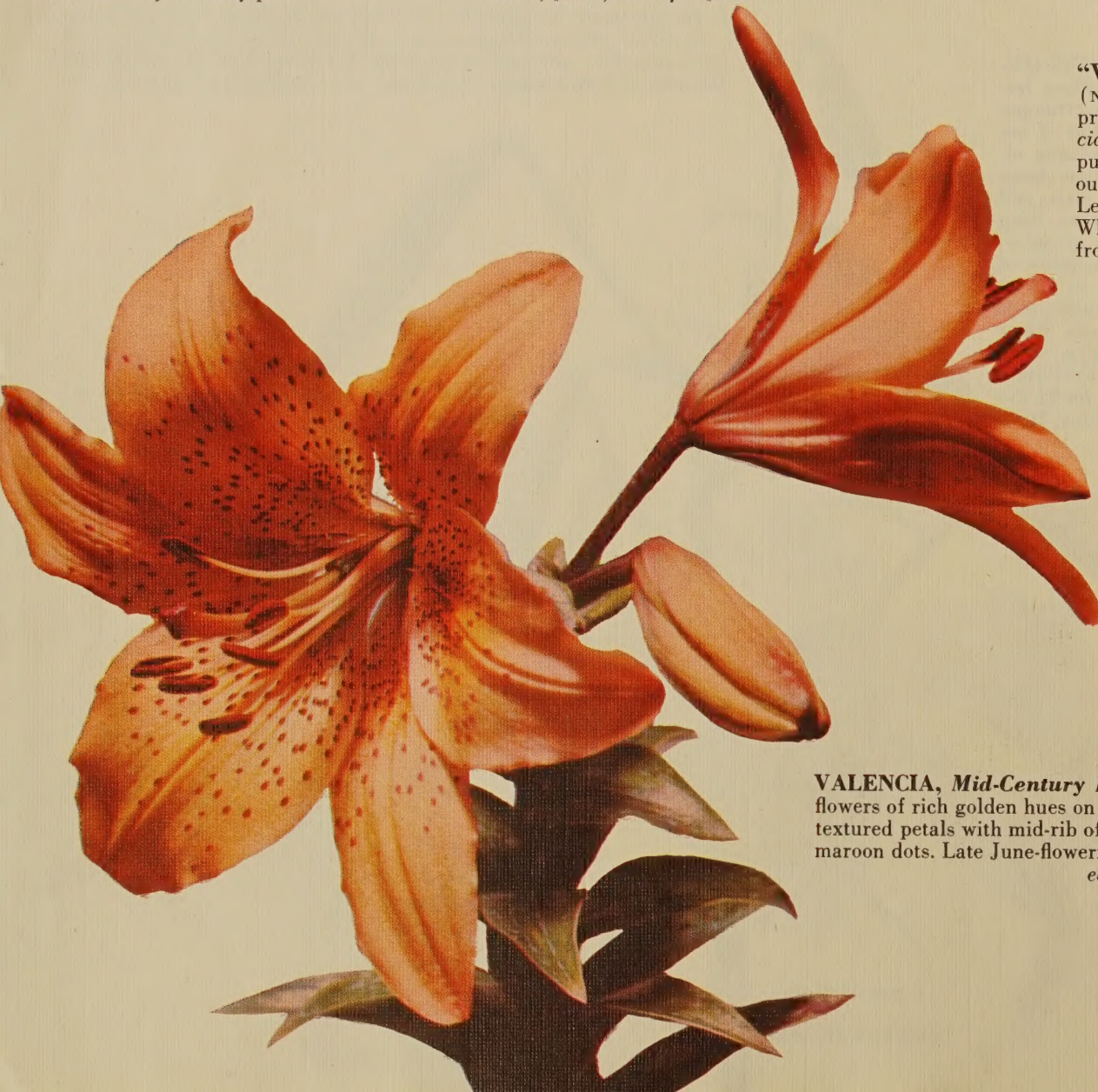
VALENCIA, Mid-Century Hybrid . Outward-facing flowers of rich golden hues on three foot stems, strongly textured petals with mid-rib of bronze and many minute maroon dots. Late June-flowering. One of our best. each, $1.25; three for $3.50