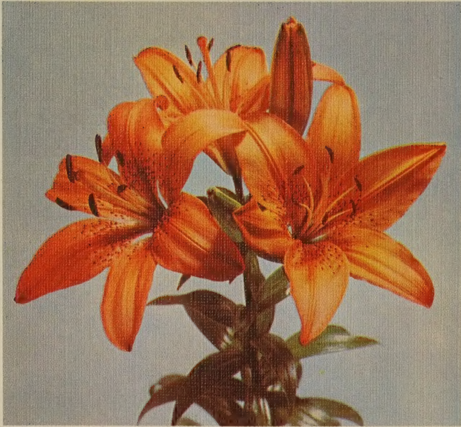
JOAN EVANS, Mid-Century Hybrid . Gay, clear, sparkling orange-yellow color, upright-flowering on four foot stems, early July and later than the others in this group, it extends your flowering season. Extremely sturdy, tall, handsome and graceful, Joan Evans, a newcomer to our lily family, is one of which we are justifiably proud. each, $1.25; three for $3.50