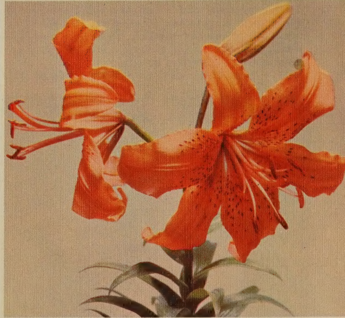
SERENADE, Mid-Century Hybrid . A late-flowering, clean, brilliant, sparkling orange with outward-facing flowers, sturdy, two-foot stems, ideal for border planting and for pots, deep green glossy foliage. each, $1.25; three for $3.50