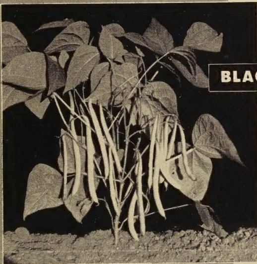
BLACK VALENTINE STRINGLESS

Growers appreciate Corneli's superb strain of Tendergreen beans for uniformity . . . productivity . . . long, smooth pods . . . fine clean appearance of the seed and good germination. (The entire Corneli acreage is Idaho Certified for freedom from disease.)