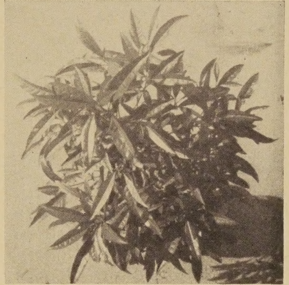
THE SPACE IS FAMILIAR