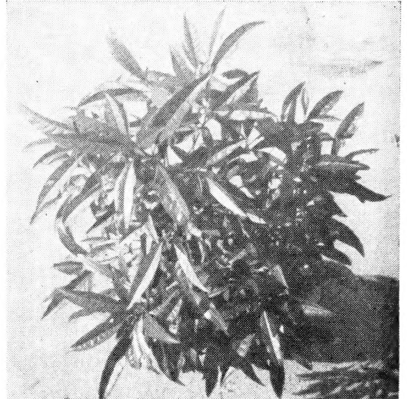
THE SPACE IS FAMILIAR