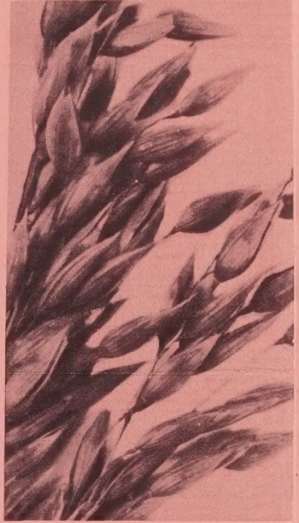
Figure ahead to harvest time... and ask yourself which is worth most... an extra 6, 8, or 10 bushels from each acre... or a few cents per bushel saved on seed cost. Because there is cheaper seed around than these Hoffman strains. But you can't buy better oats... here are today's "best buys" in seed oats:

MONEY-BACK terms and complete conditions — Catalog page 23.