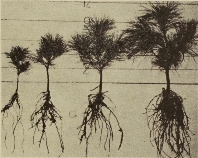
G. White Pine 2-2, 3 to 8 ins.