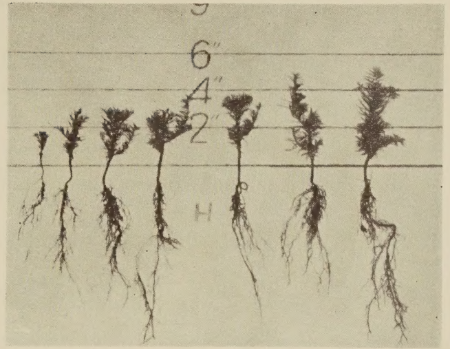
H. Taxus from seed 1-2, bed run