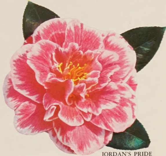
JORDAN'S PRIDE (Herme)