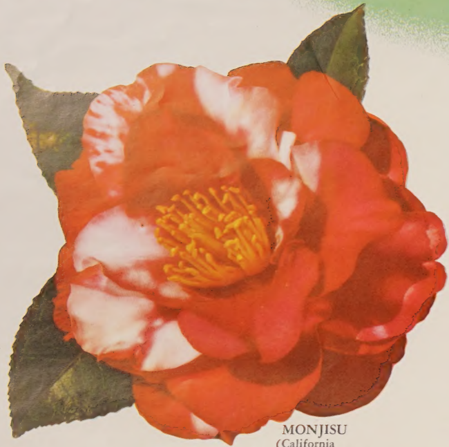
MONJISU (California Donckelari Var.)