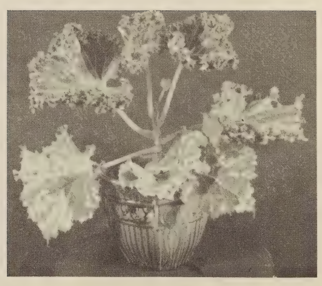
MANICATA AUREO CRISTATA