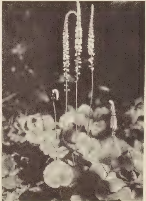
(At Right) Galax Aphylla Listed on Page 17