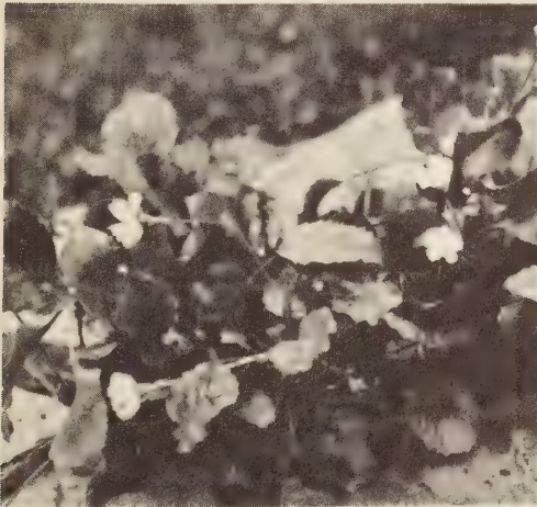
(Above) Shortia Galacifolio. Oconee-Bells