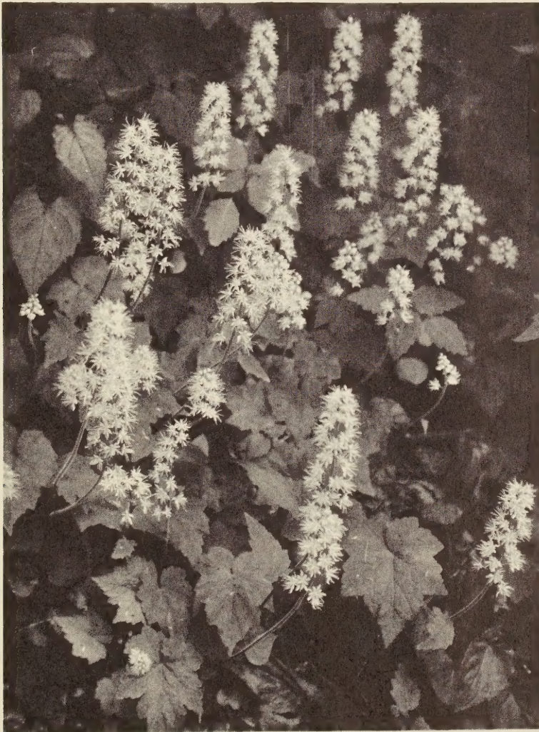
Tiarella Cordifolia Listed on Page 4